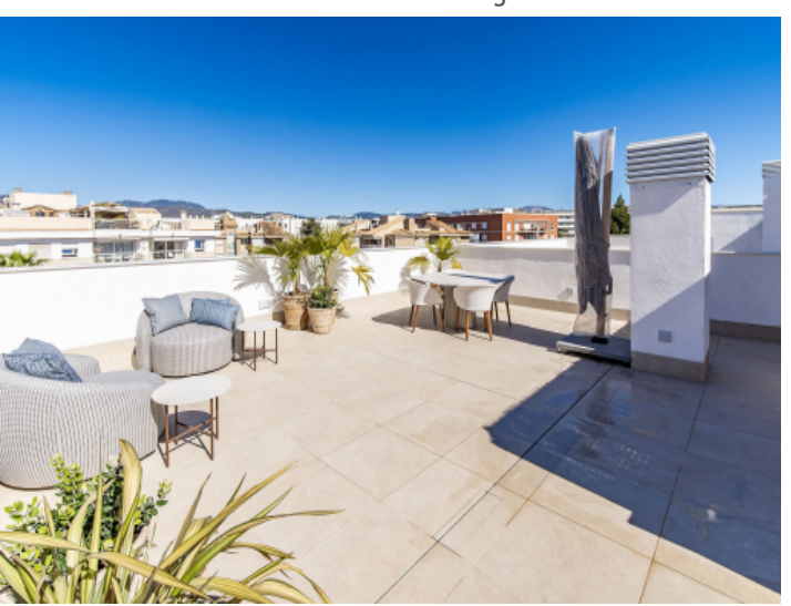
Spacious rooftop terrace with city and sea views