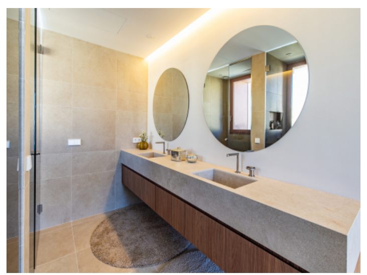
En-suite master bathroom