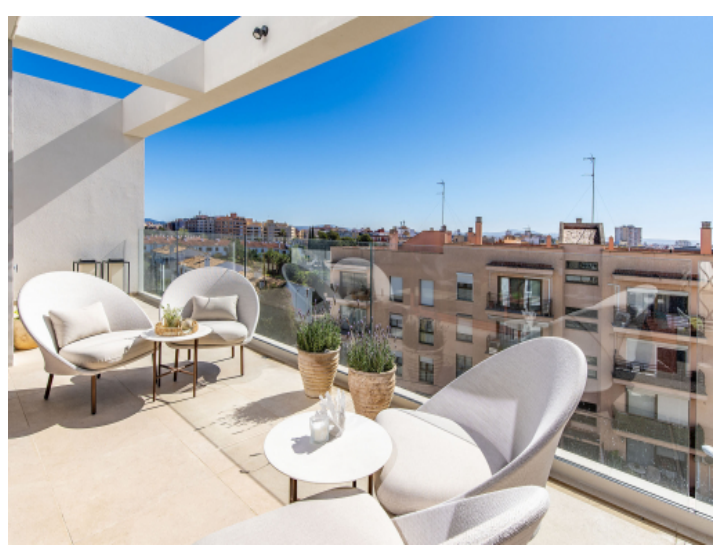
Sun terrace on the living level