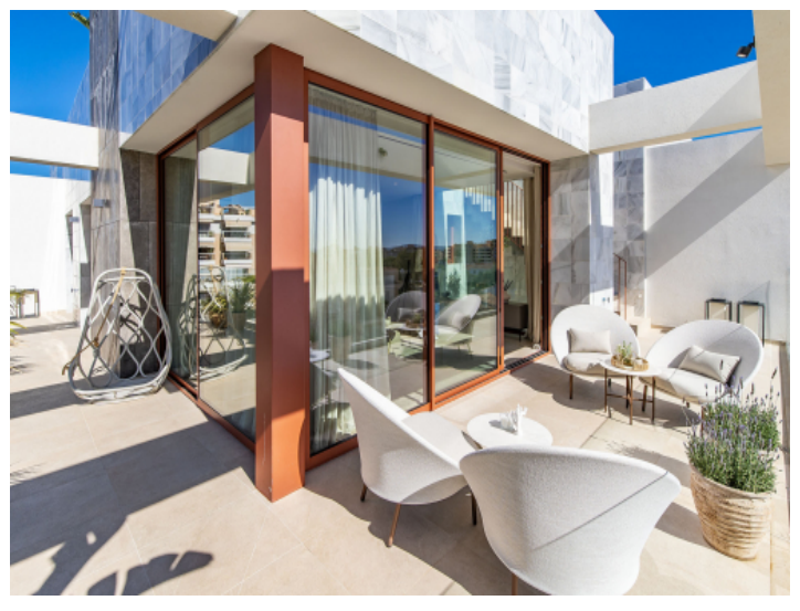
Terrace on the living level