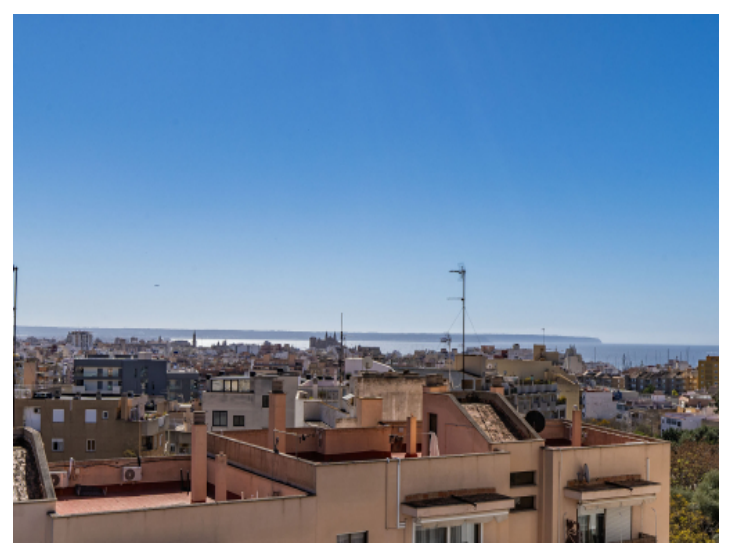
View of the cathedral and the sea