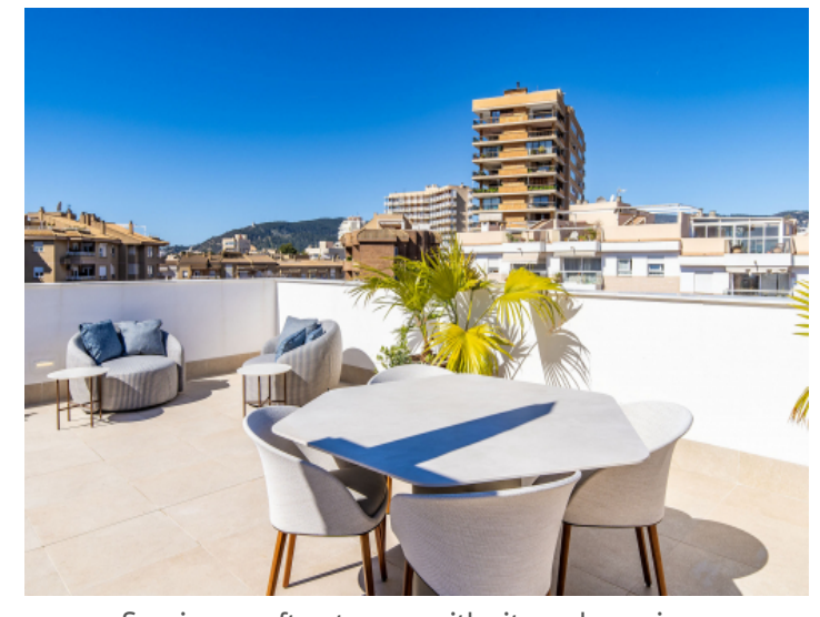
Spacious rooftop terrace with city and sea views