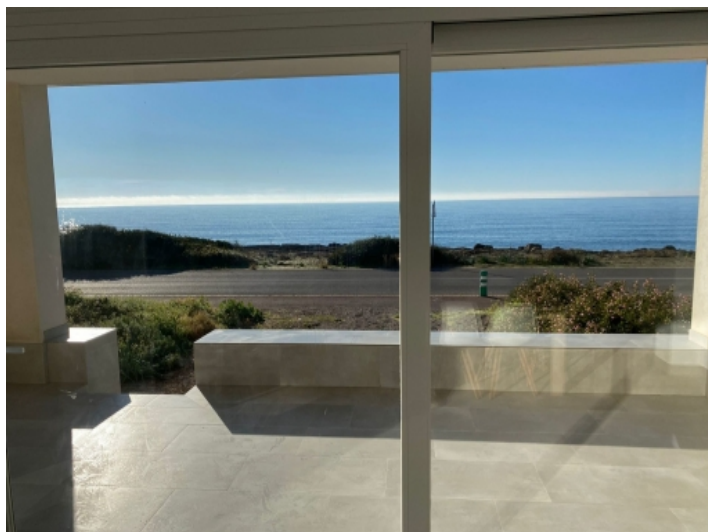
Sea view from the living area