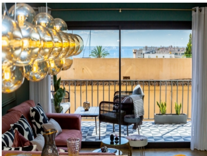
Living area with sea views