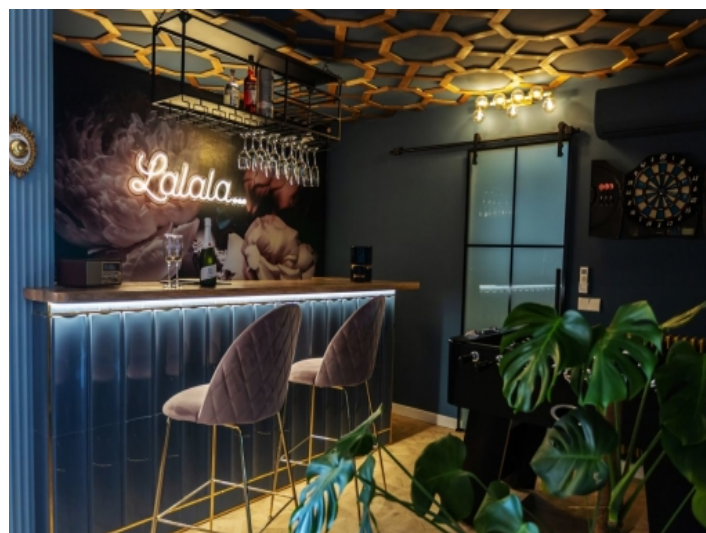
Stylish bar next to the kitchen