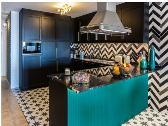
Modern kitchen in black