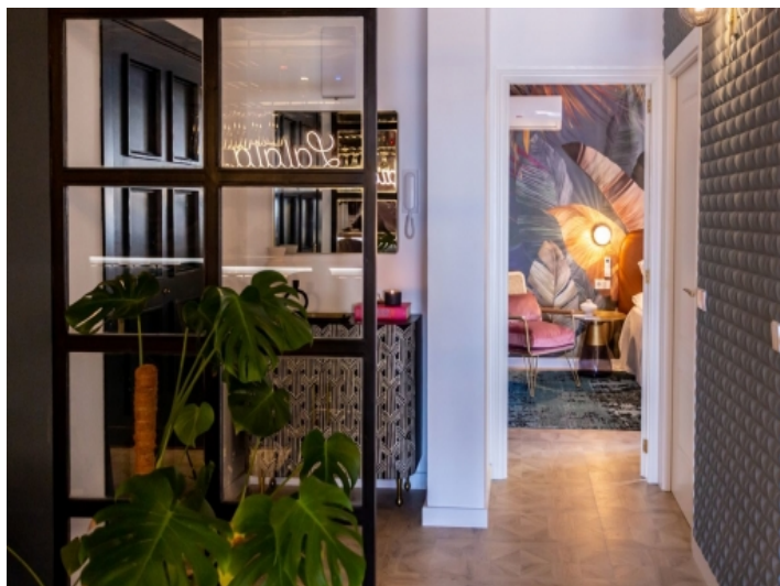
Inviting entrance area