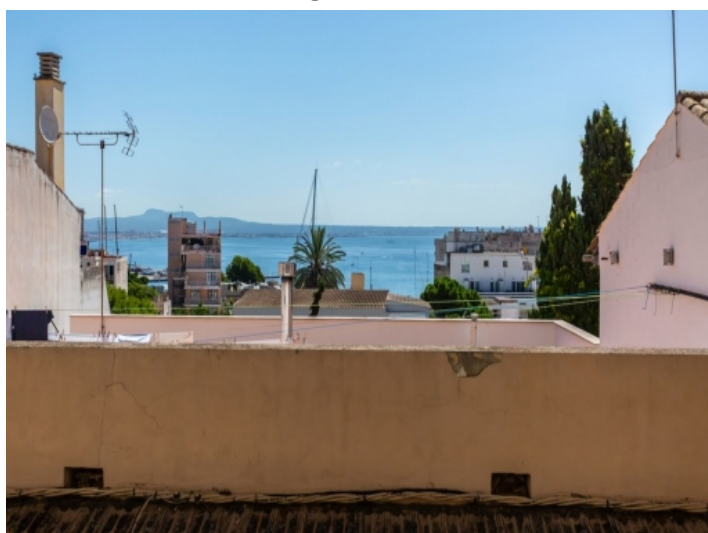
Views as far as the sea