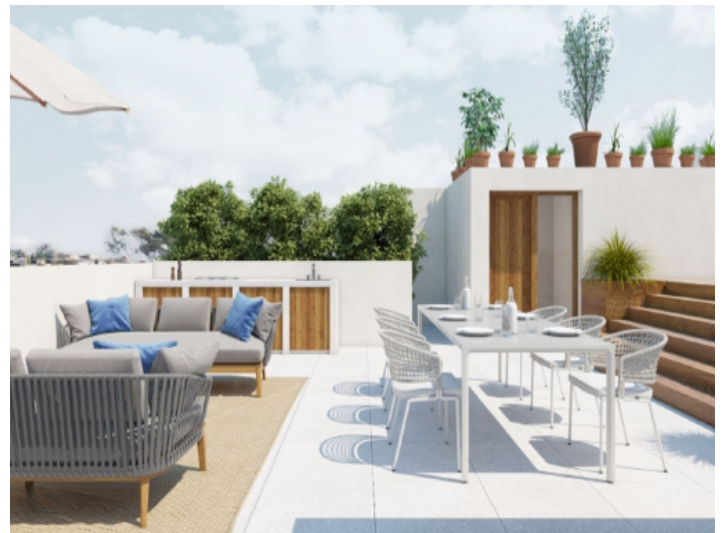
Lounge terrace and dining area