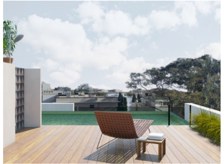
Pool and sun terrace