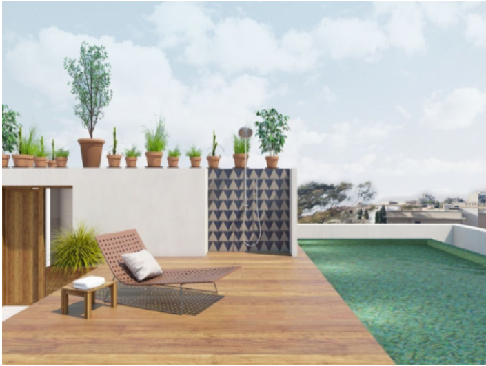
Pool and sun terrace