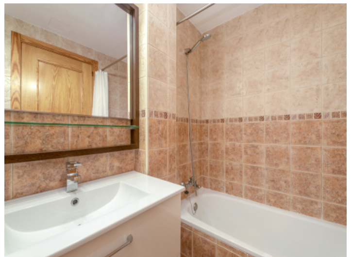
Bathroom with bathrub