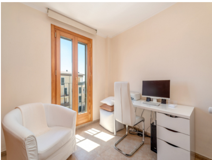
Study room or bedroom