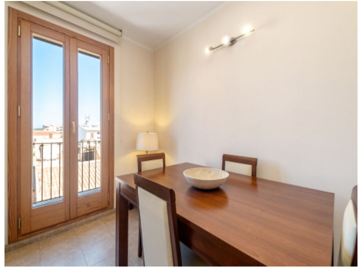
Dining area with french balcony