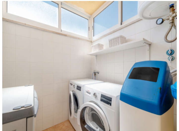
Separate laundry room