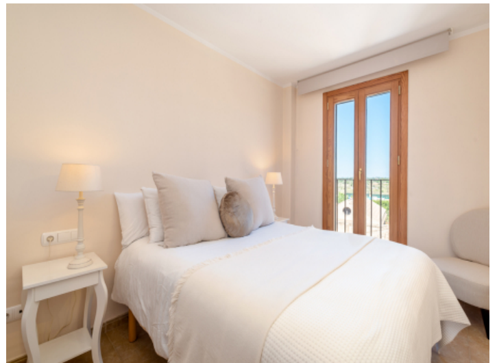
Beautiful double bedroom