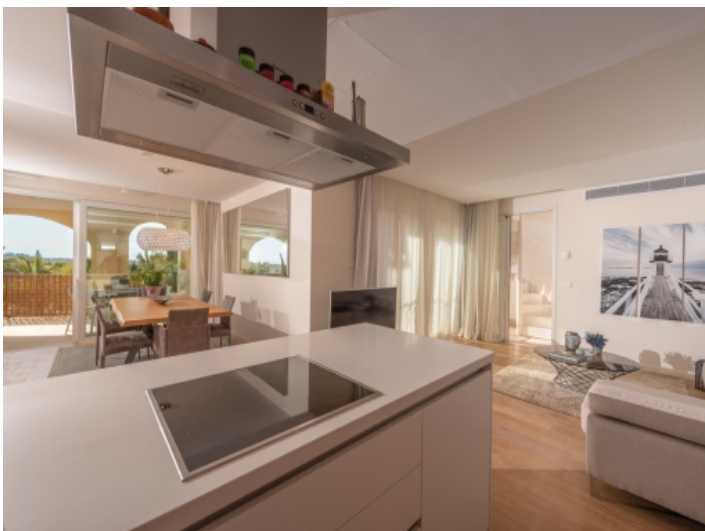
Open living and dining area with kitchen