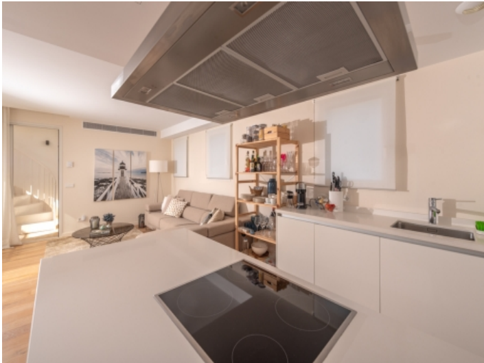
Modern kitchen with cooking island