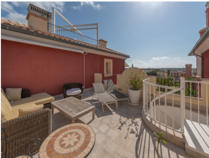
Splendid roof top terrace