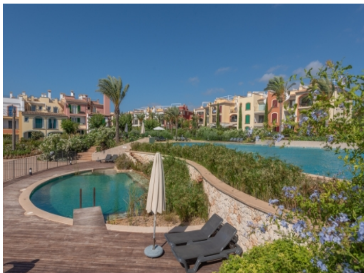
Separate pool area next to the main pool