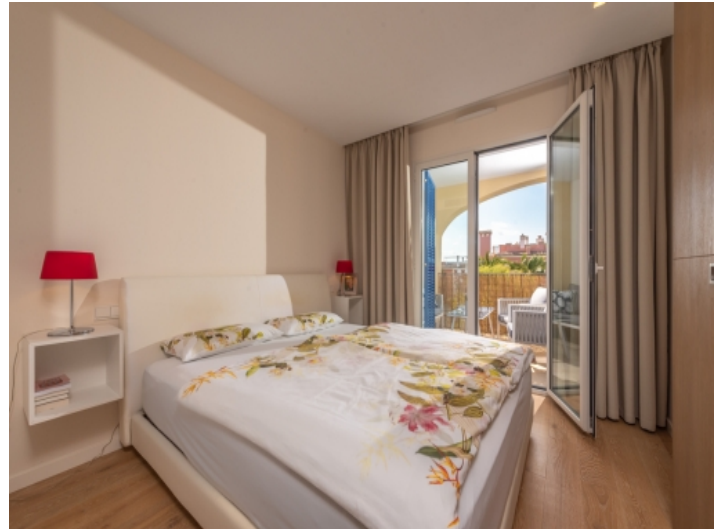
Master bedroom with balcony access