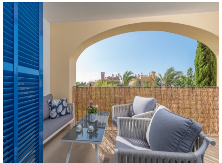
Inviting chill out lounge on the balcony