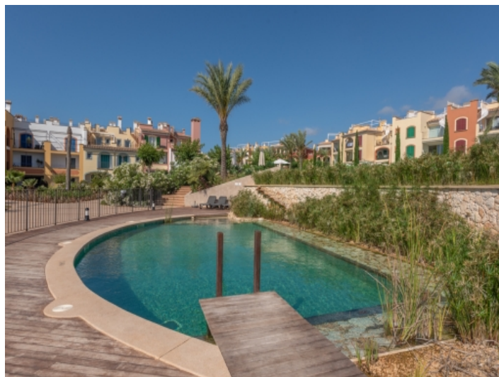
Elegant design of the pool landscape