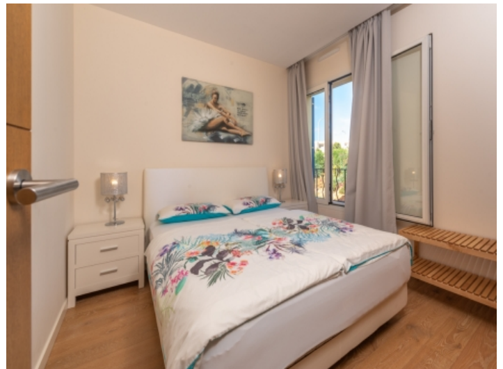
Second double bedroom