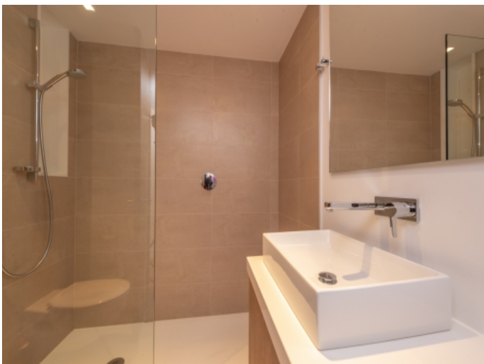
Bathroom with walk-in shower