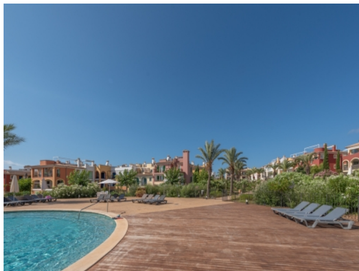
Fantastic pool area with sun loungers