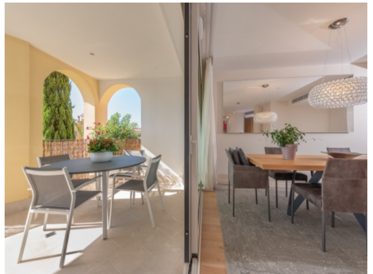
Access to the noble living area