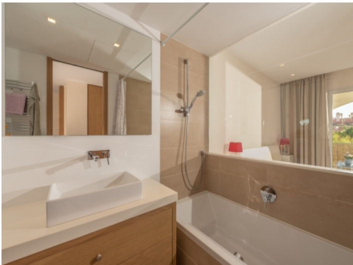
Bathroom en Suite with bath tub