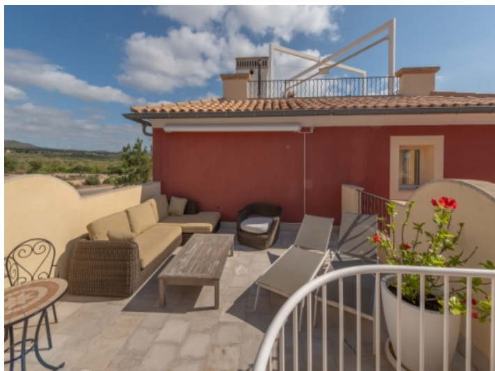
Sunny roof top terrace