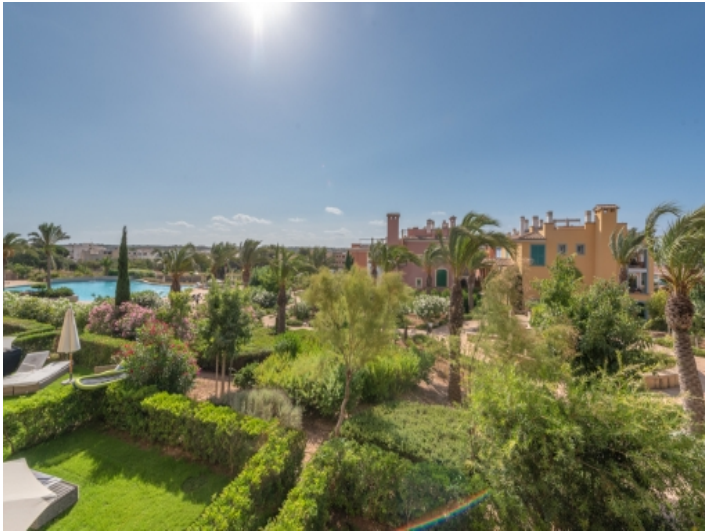
View from the apartment at the communal pool area