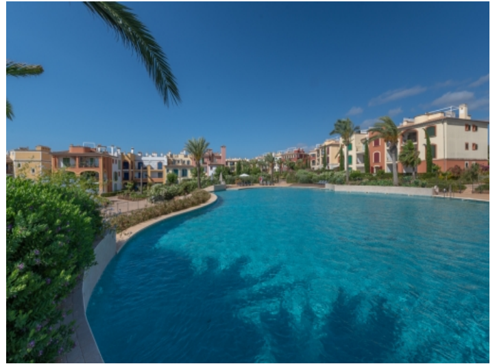
Large communal pool area