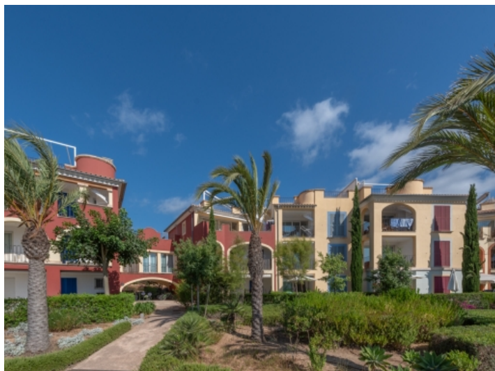
Exterior view of the residential complex