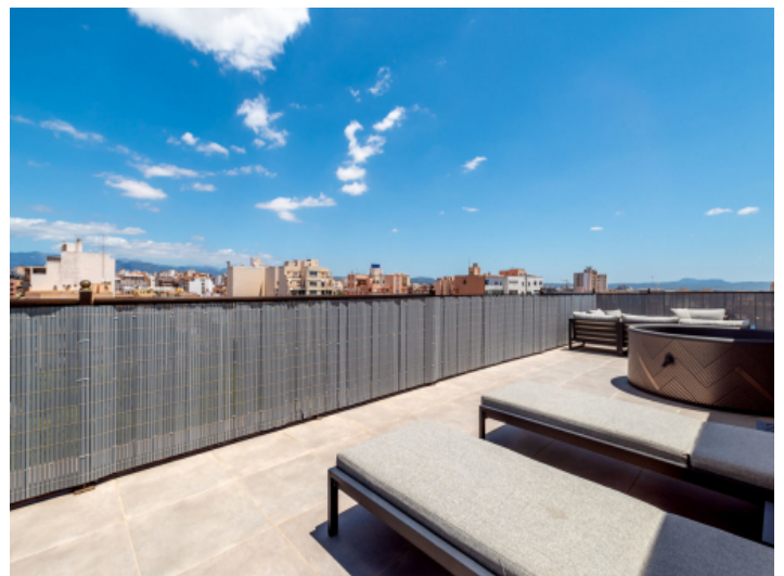
Terrace with a view