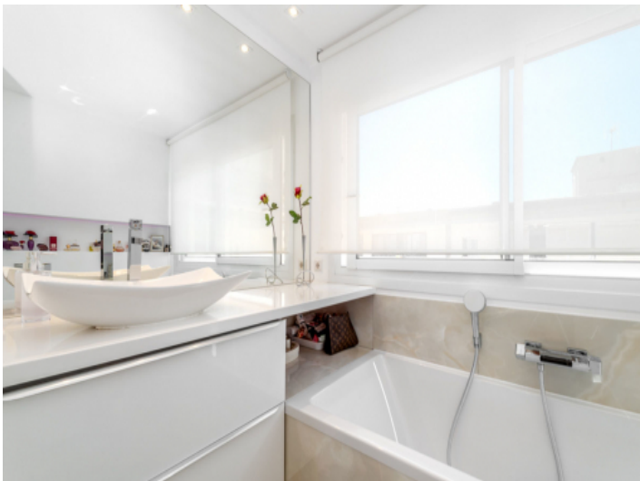
Modern bathroom with bathtub