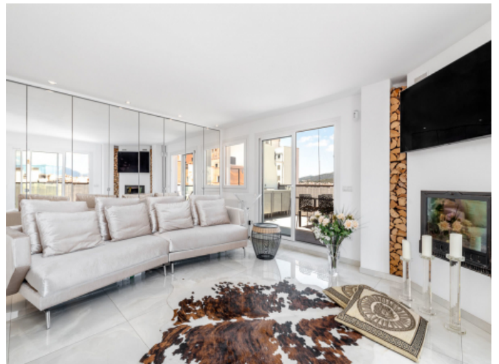
Living area with terrace access