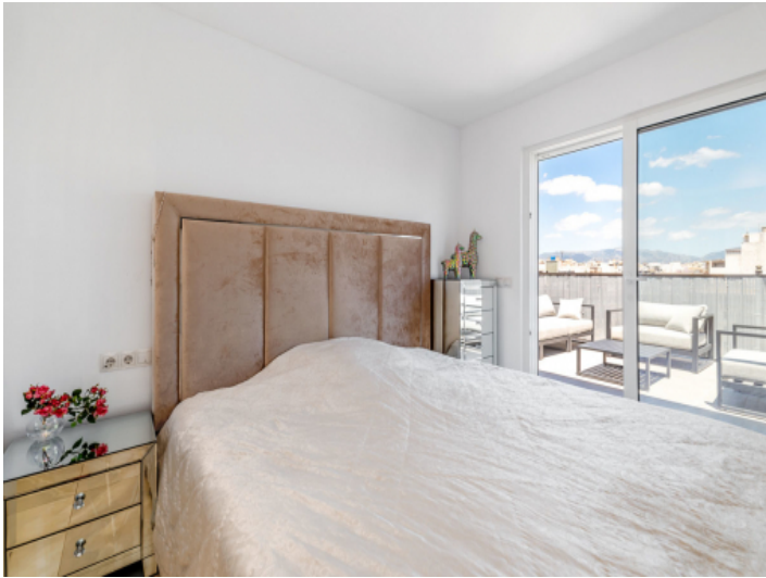
Bedroom with terrace access