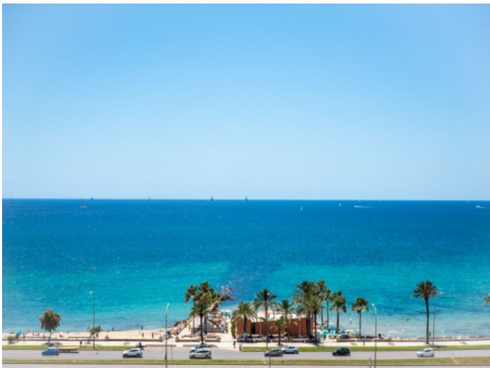
Sea and beach views