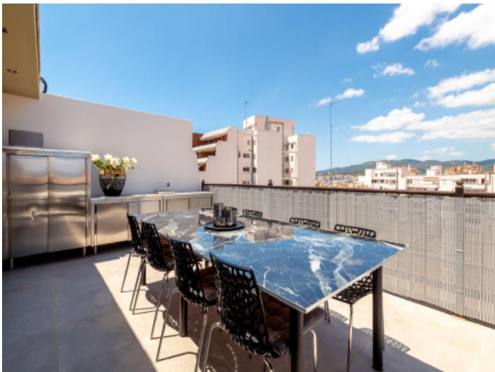
Outdoor dining area on the terrace