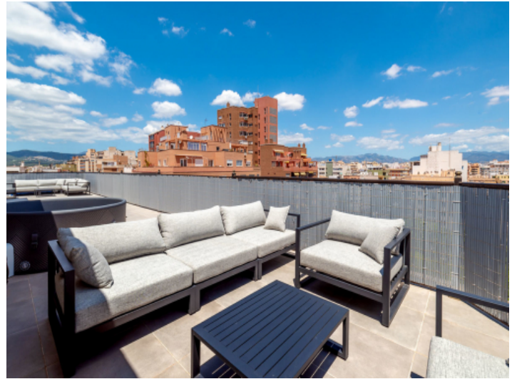
Large roof terrace