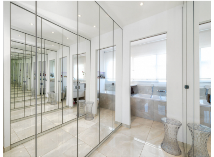
Adjoining dressing area