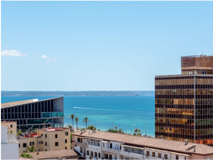
Fantastic views to the sea