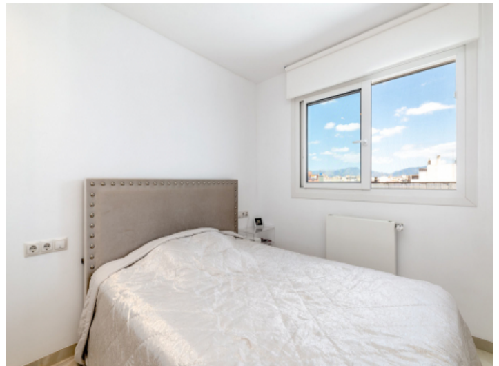
One of 3 bedrooms