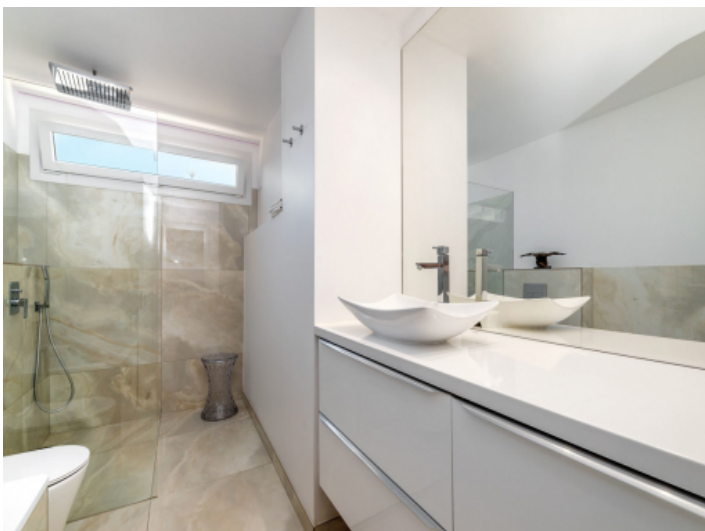
One of 2 bathrooms