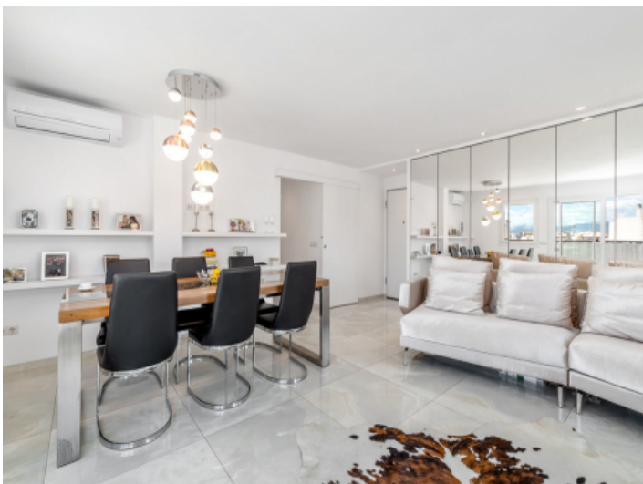
Elegant living and dining area