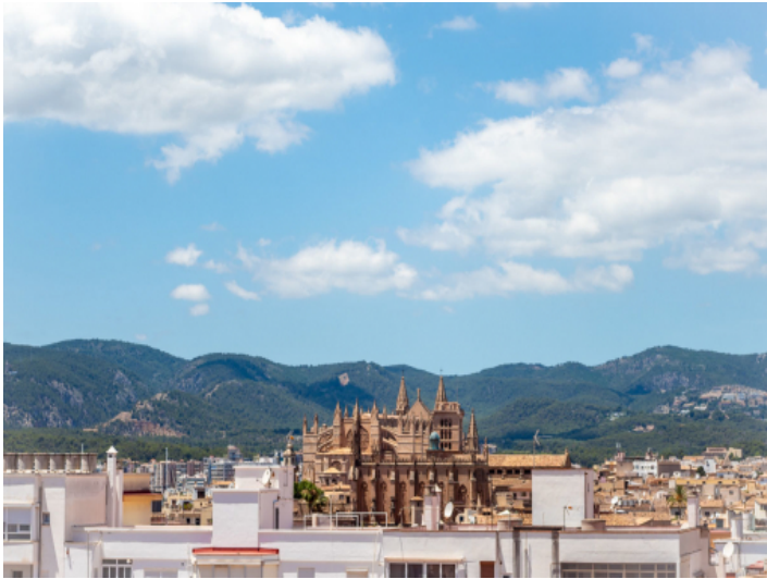
View as far as the cathedral