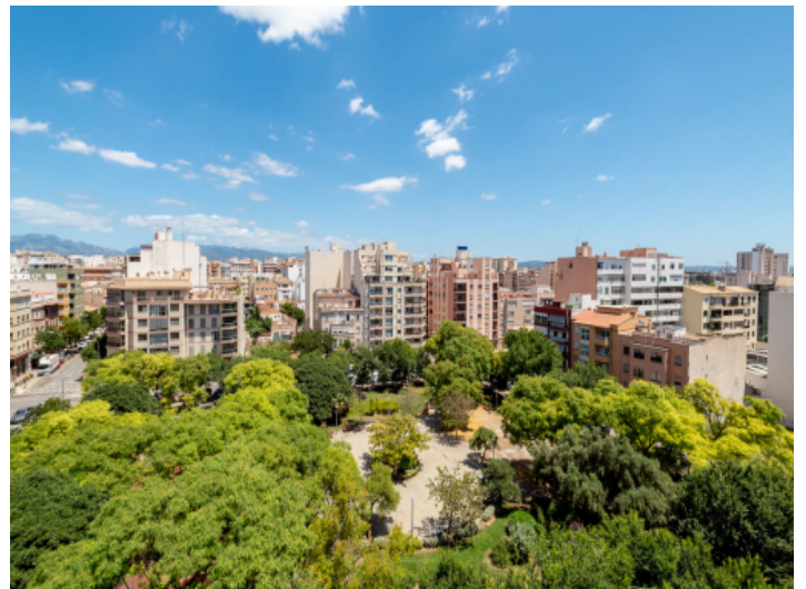
Views over the parque