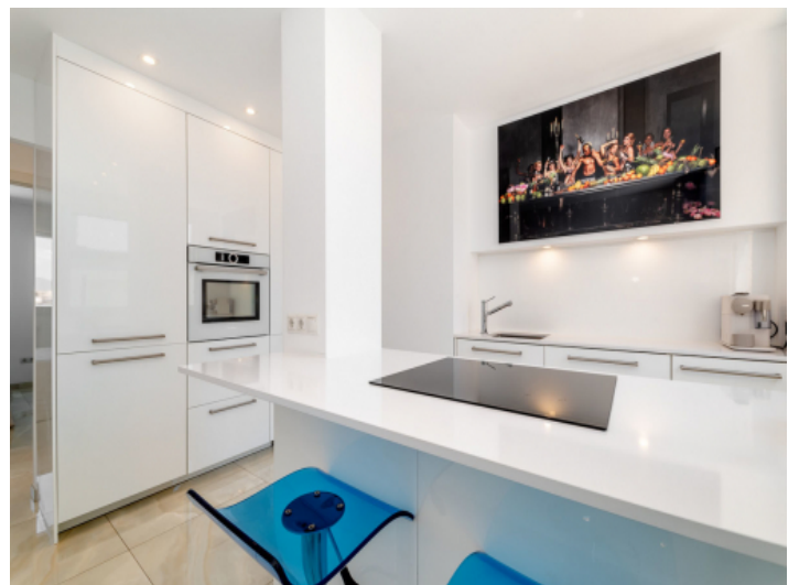
Modern kitchen with cooking island