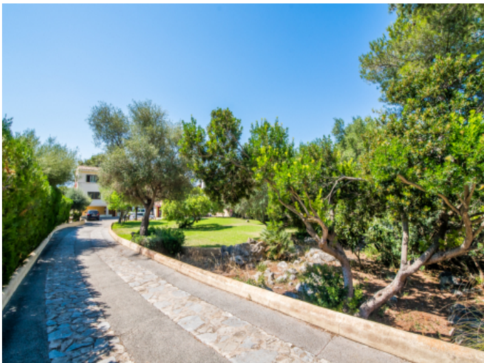
Access to the property