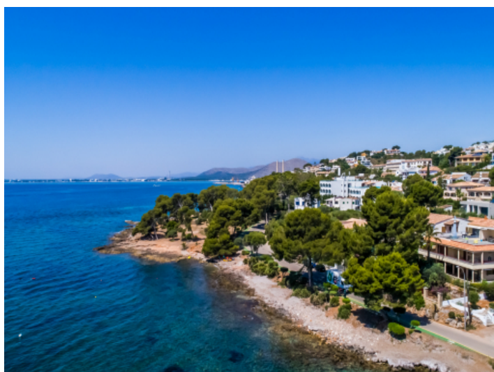
View of the sea