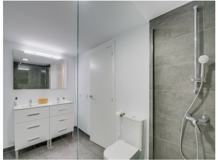
Elegant bathroom with shower