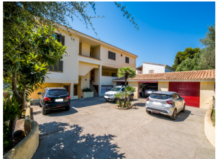
Large driveway of the house