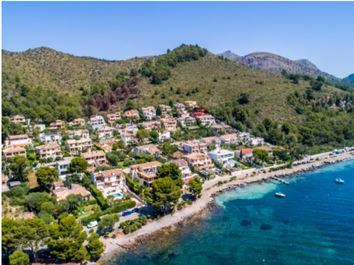
View from above