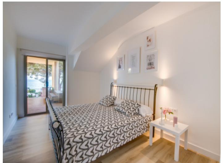
Large double bedroom