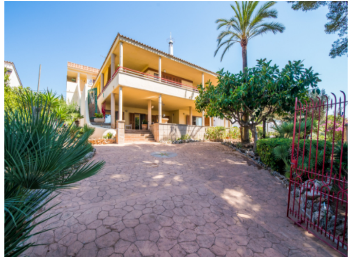
Access to the house