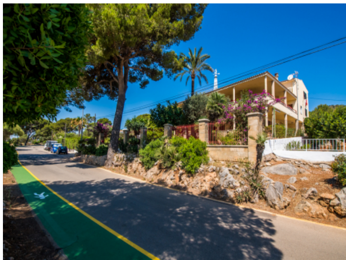
Exterior view of the house