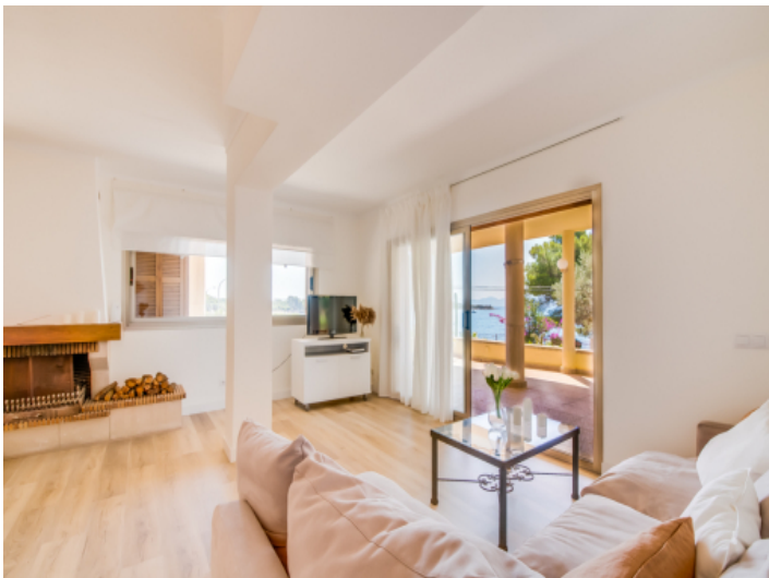
Living area with sea views