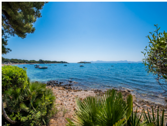
View of the sea