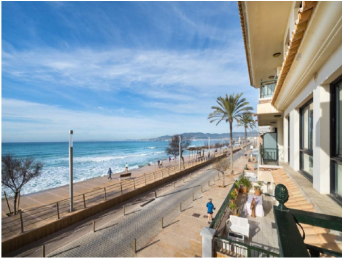
Balcony with sea views