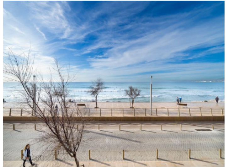
View to the promenade