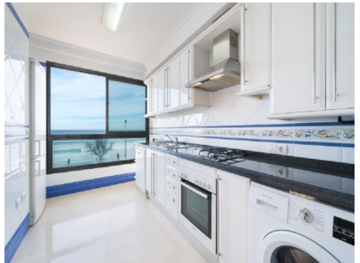
Kitchen with sea views