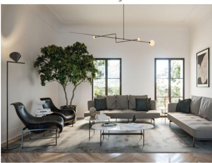
Possible living area