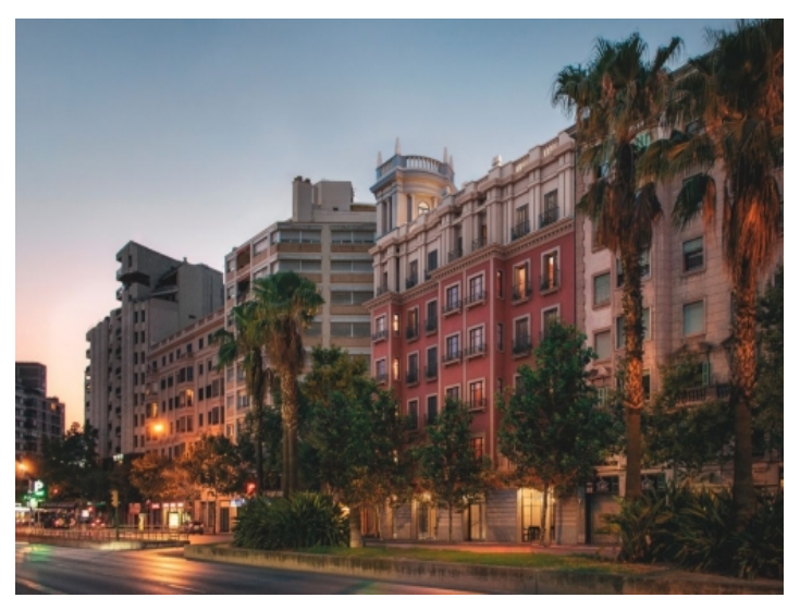
There will be 16 luxury apartments