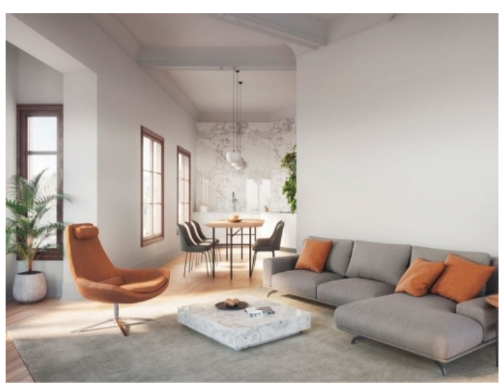
Possible living area