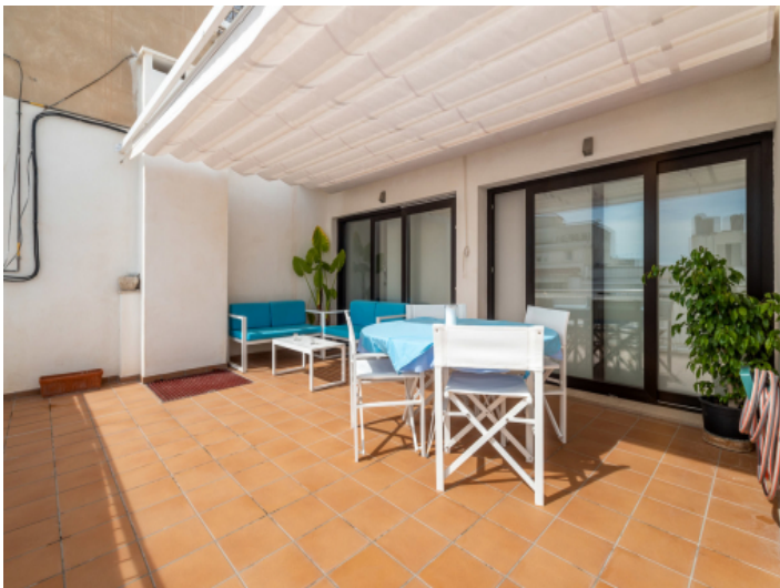
Spacious sun terrace