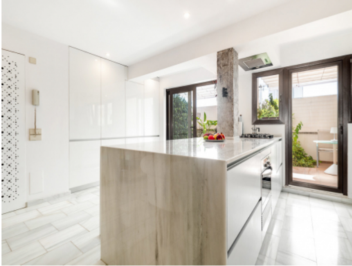
Modern kitchen with terrace access