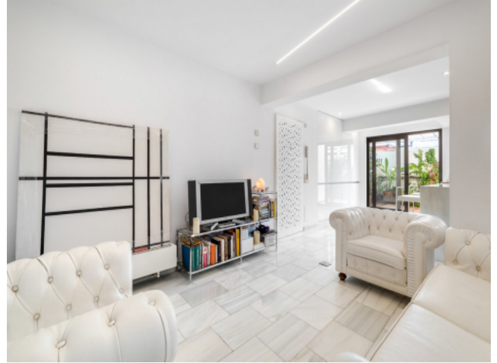
Adjoining, open living area