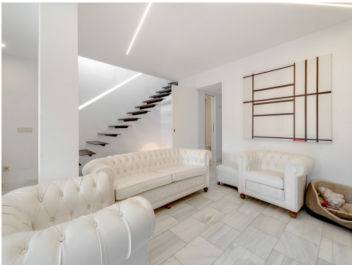
Living area with stairs to the upper floor