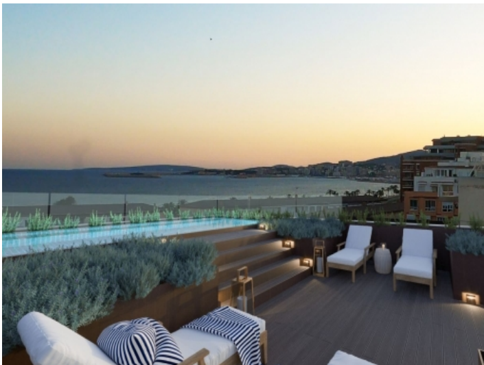
Roof terrace and pool