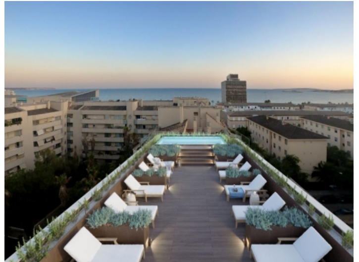
Roof terrace and pool