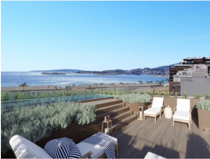
Roof terrace and pool