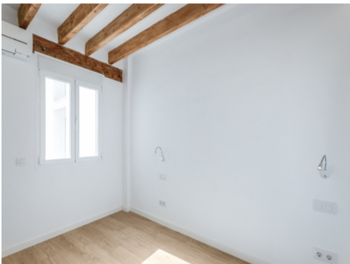
One of 2 bedrooms