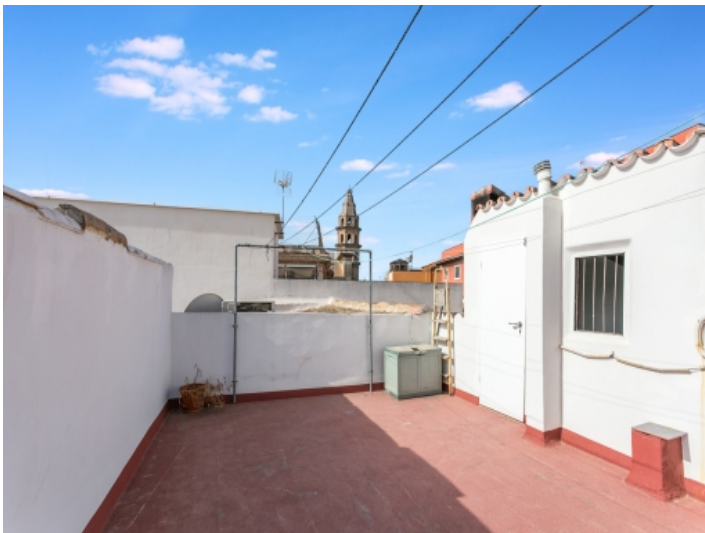
Communal roof terrace