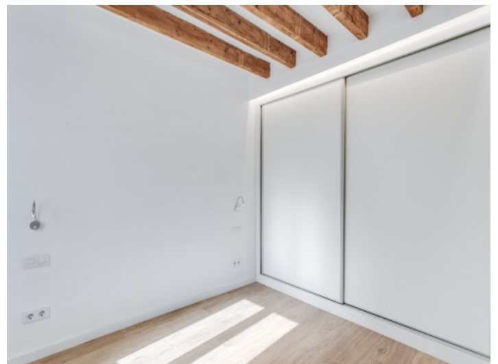
One of 2 bedrooms