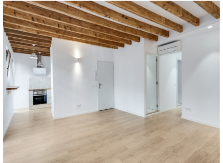
Bright living area with wooden ceiling beams