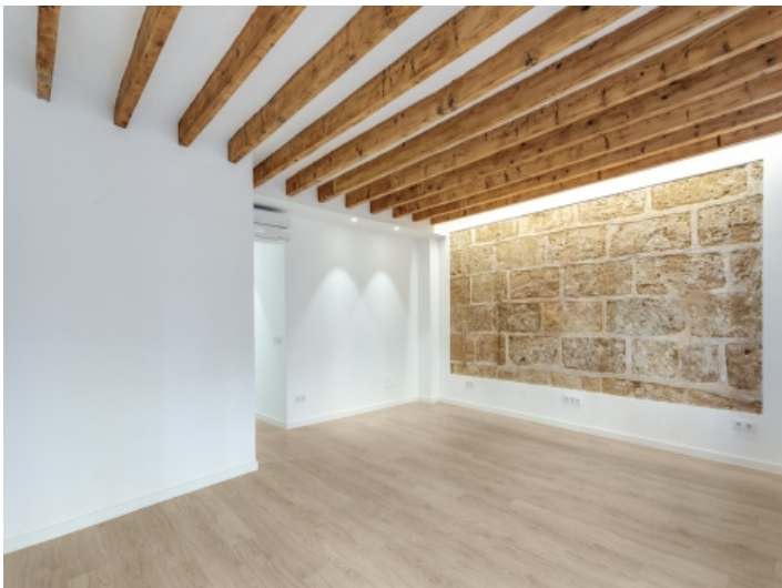
Living area with authentic sandtone wall