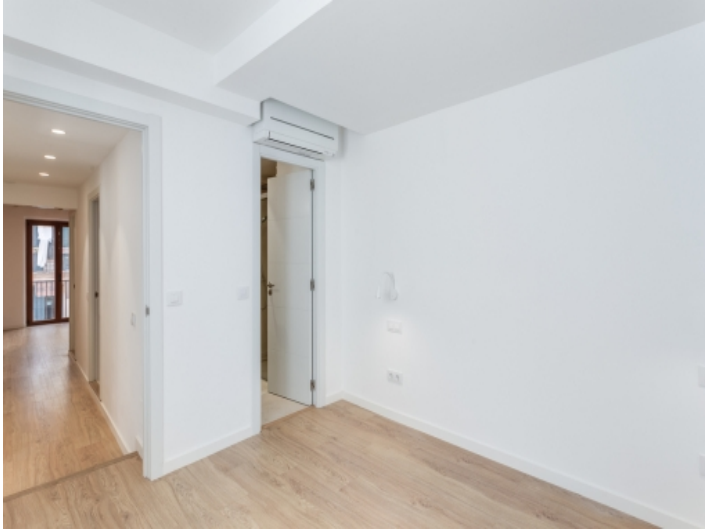
View to the bathroom