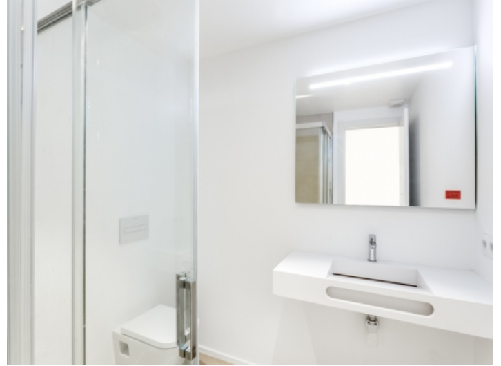
One of 2 bathrooms