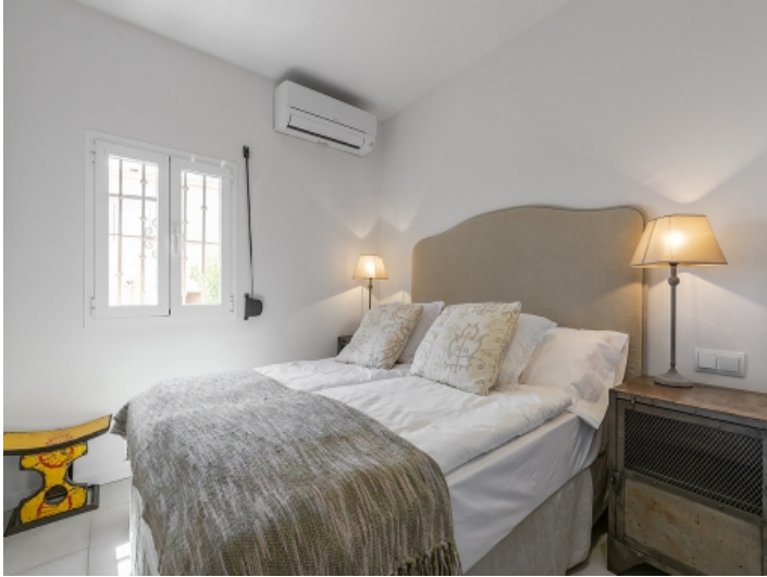
First double bedroom