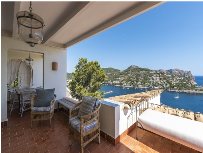
Terrace with various seating areas