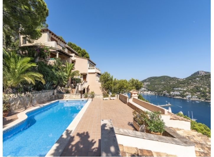
Well-maintained complex with pool