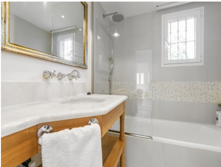
Modern en suite bathrooms