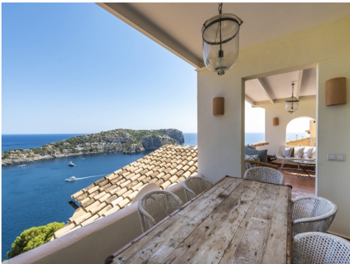
Dining area with fantastic sea views