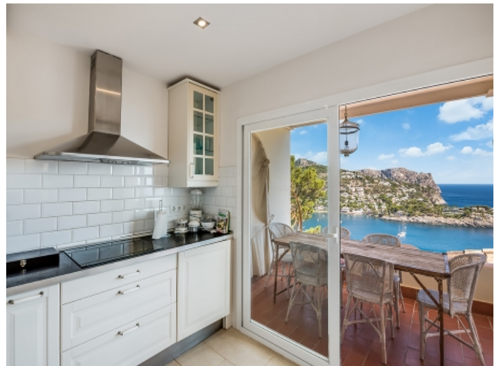
Access to the outdoor dining area