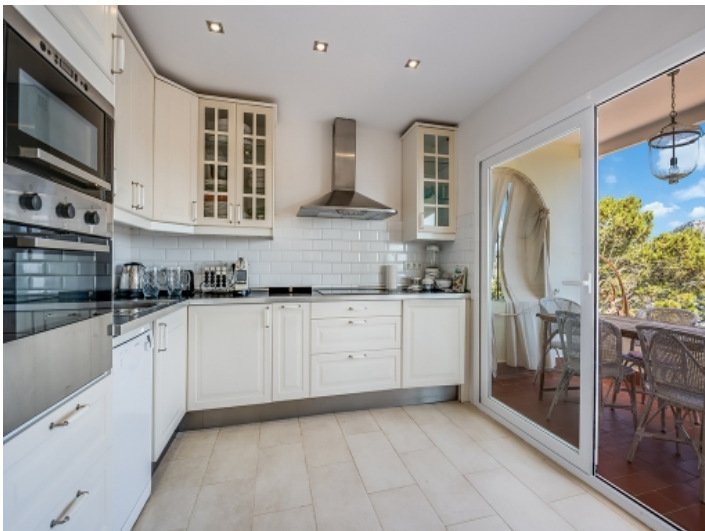
Modern, spacious kitchen