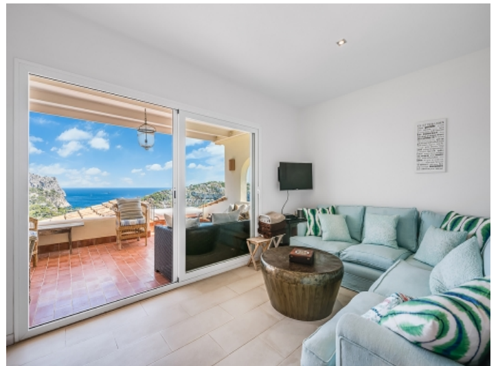
Living area with direct terrace access