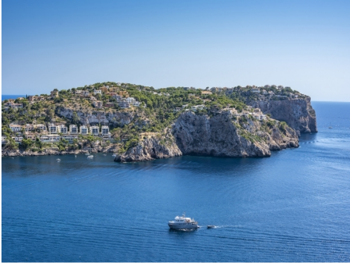
Breathtaking views of the open sea