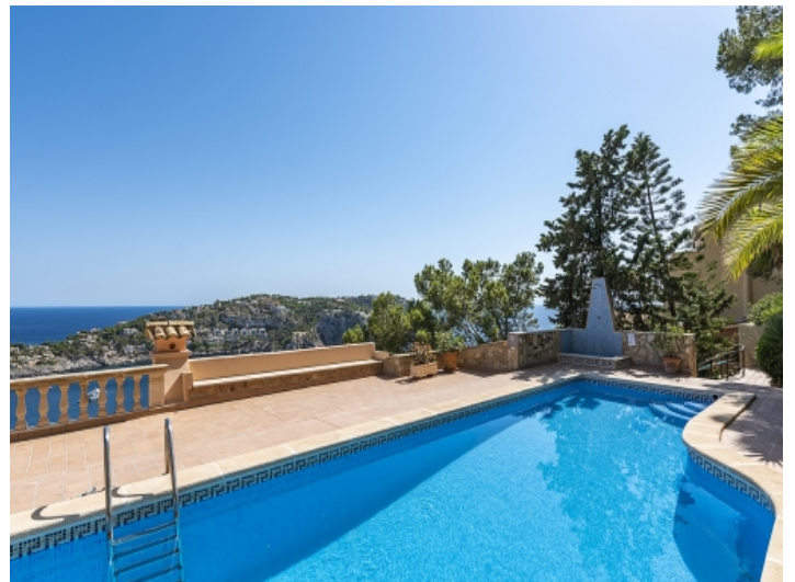
Communal pool in a unique location