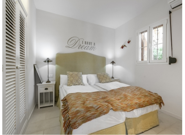
Second double bedroom