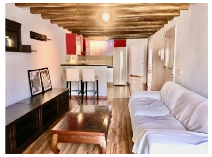
Living area and kitchen