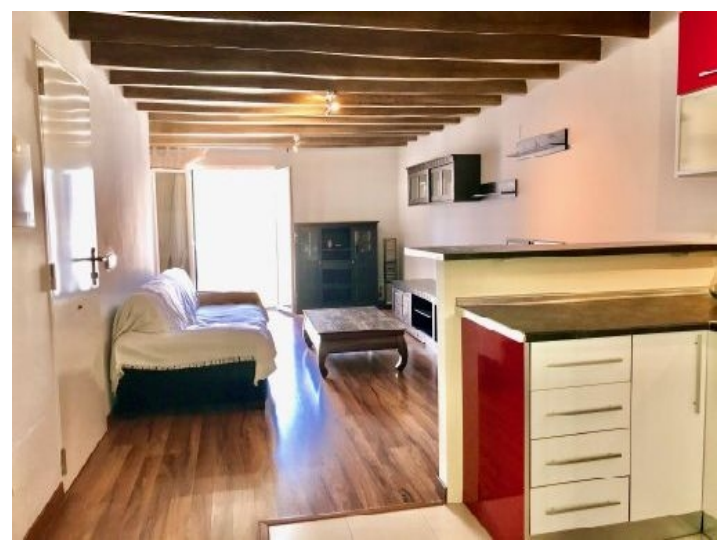
Living area and kitchen