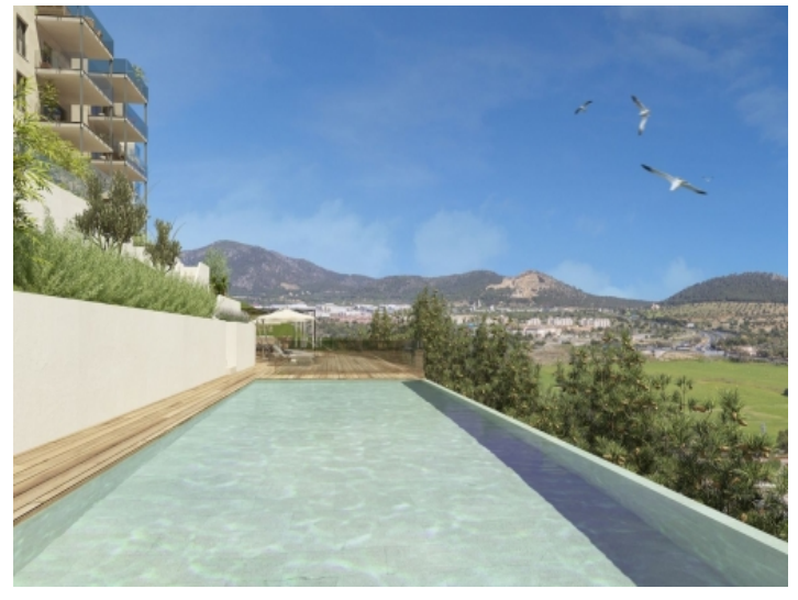
View of the community pool