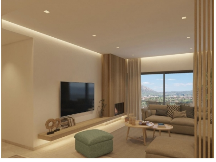
Living area with a view