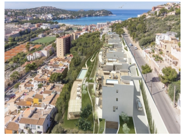
Stunning view of the city