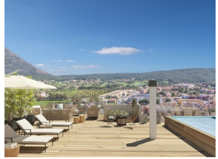
Sunny pool area