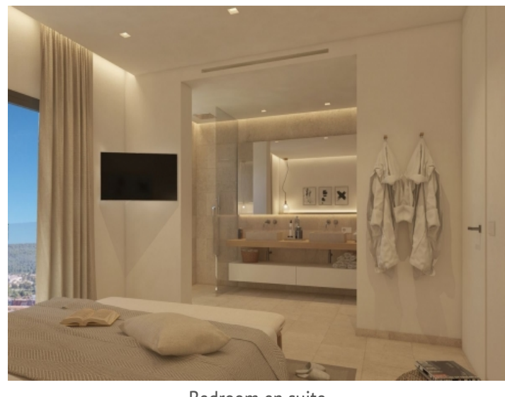
Bedroom en suite

PORTA MALLORQUINA • C./ COLOM 20 2°, 07001 PALMA, SPAIN TEL.: +34 971 698 242 • INFO@PORTAMALLORQUINA.COM • WWW.PORTAMALLORQUINA.COM