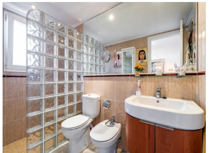
Shower bathroom en suite