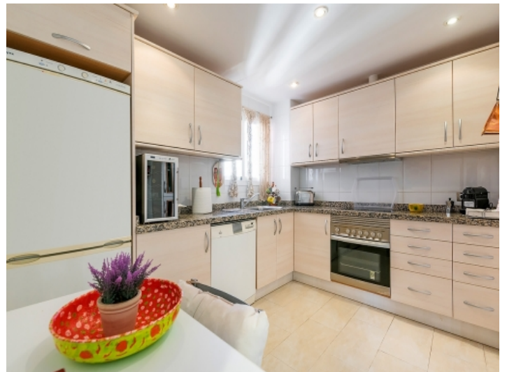
Kitchen with dining area