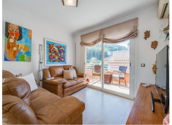
Living area with balcony