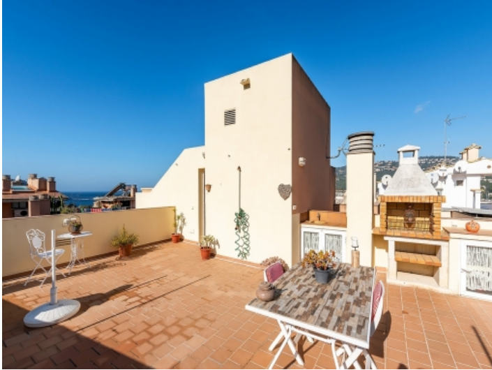
Large roof terrace with bbq area