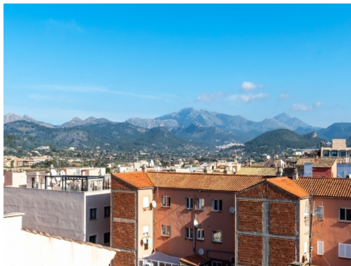
Fantastic mountain views