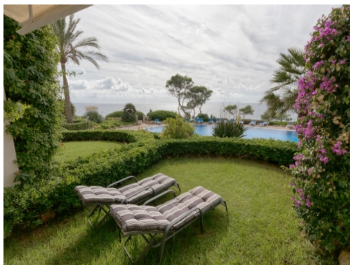
Garden with sea views