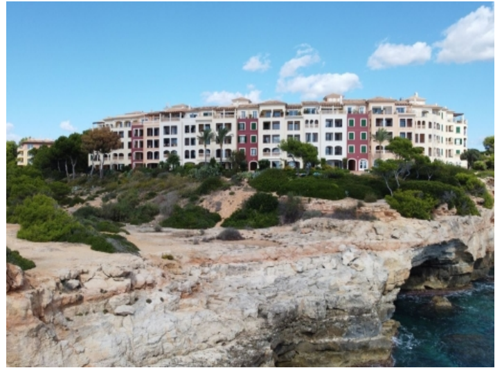
Exterior view of the residential building