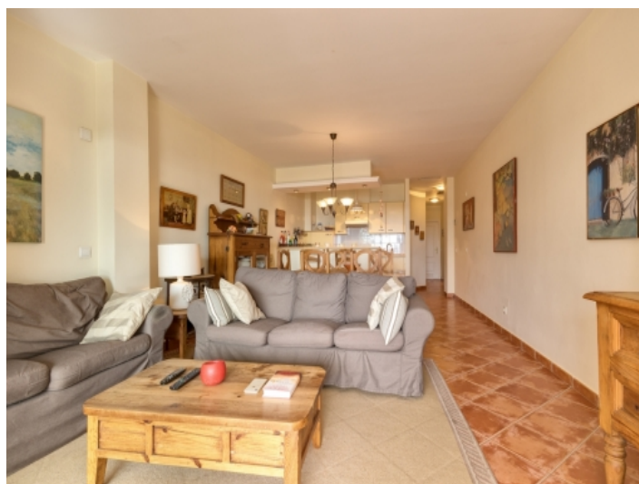
Beautiful living and dining area