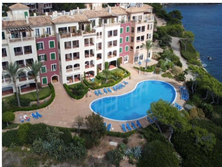
Exterior view of the pool