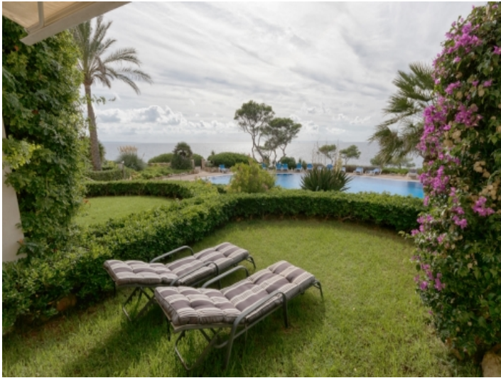
Garden with sea views