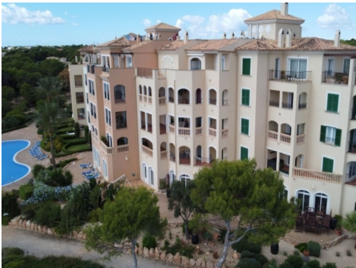
Exterior view of the residential building