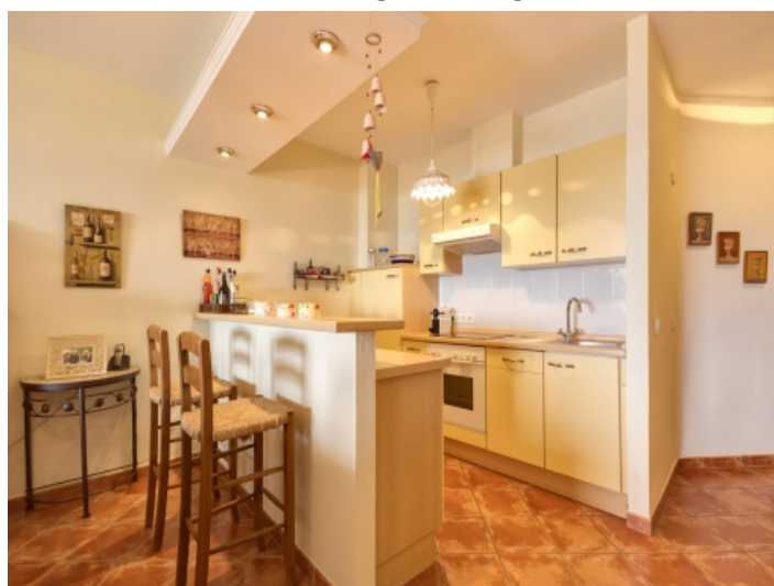
Open kitchen with bartable