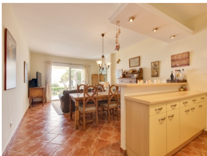
Living and dining area with garden access