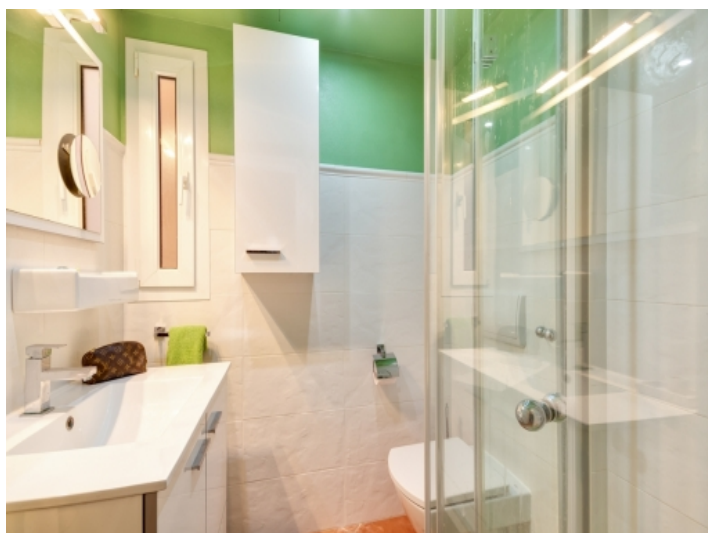
Second shower bathroom