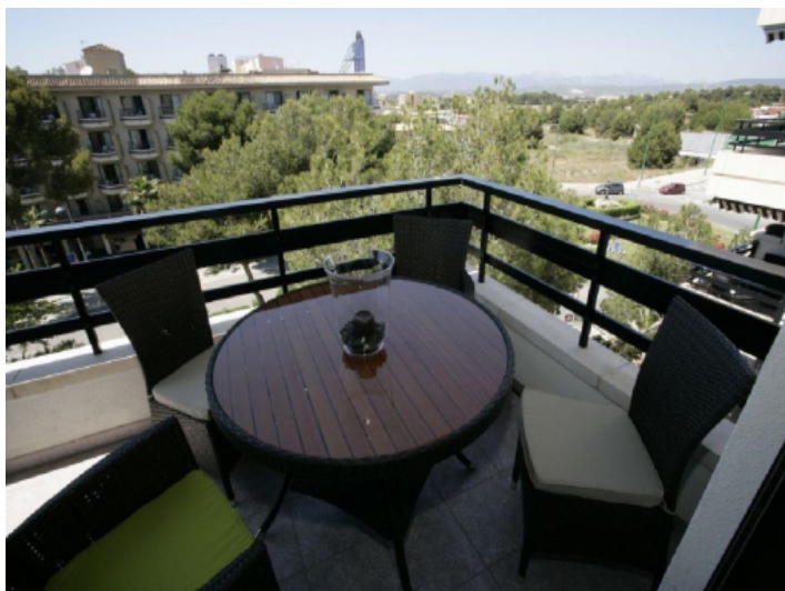
Balcony with seating area