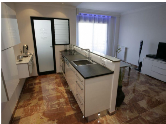
Spacious kitchen and living area