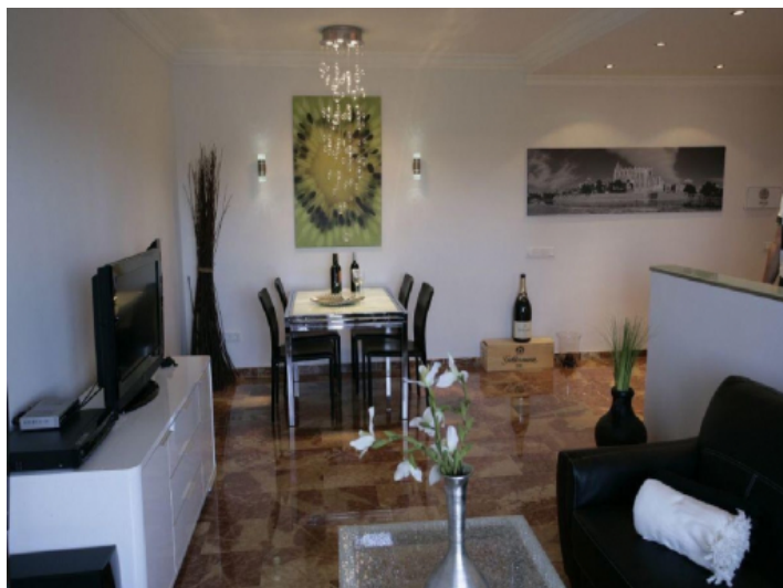
apartment, Playa de Palma