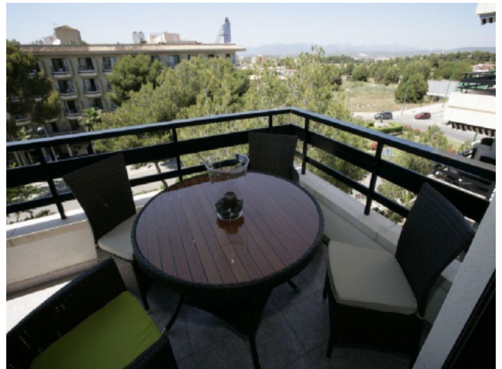
Balcony with seating area