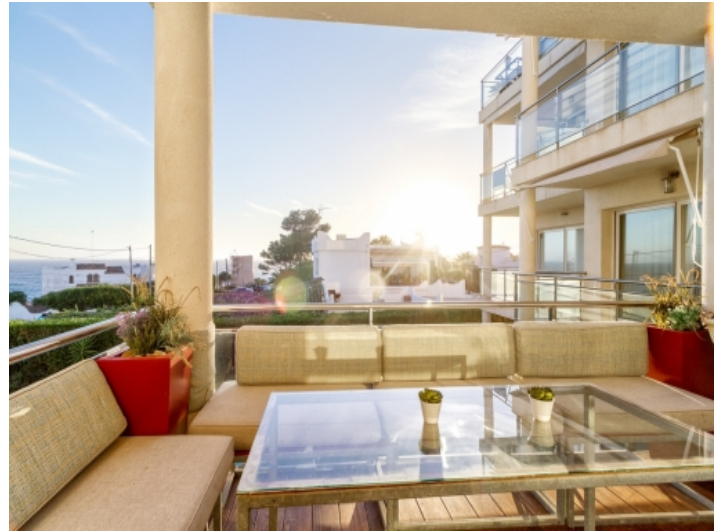
Fantastic chill-out lounge on the balcony