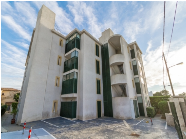
Exterior view of the complex