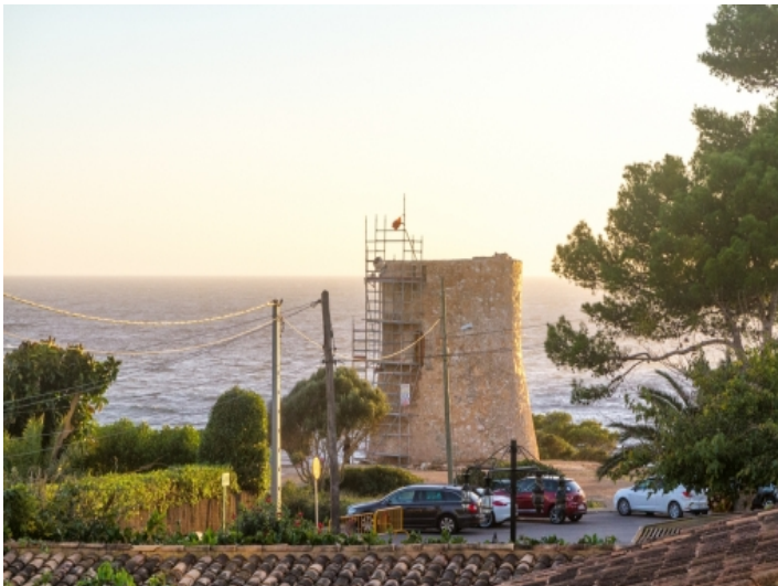
Gorgeous sea views