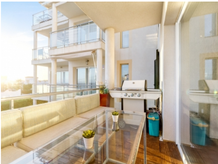
Lovely balcony with barbecue area