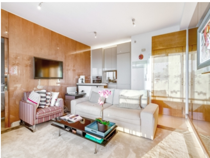
Bright kitchen and living area