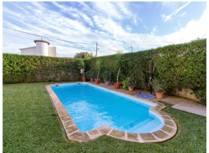
Spacious pool area