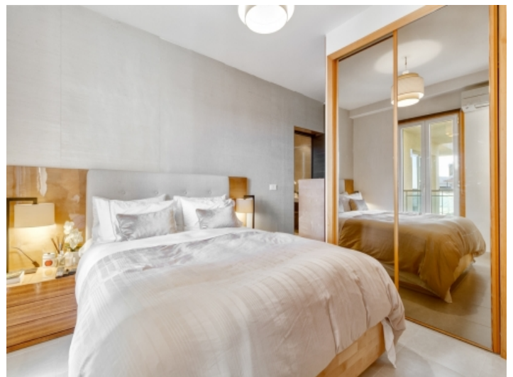
Wonderful bedroom with built-in wardrobe