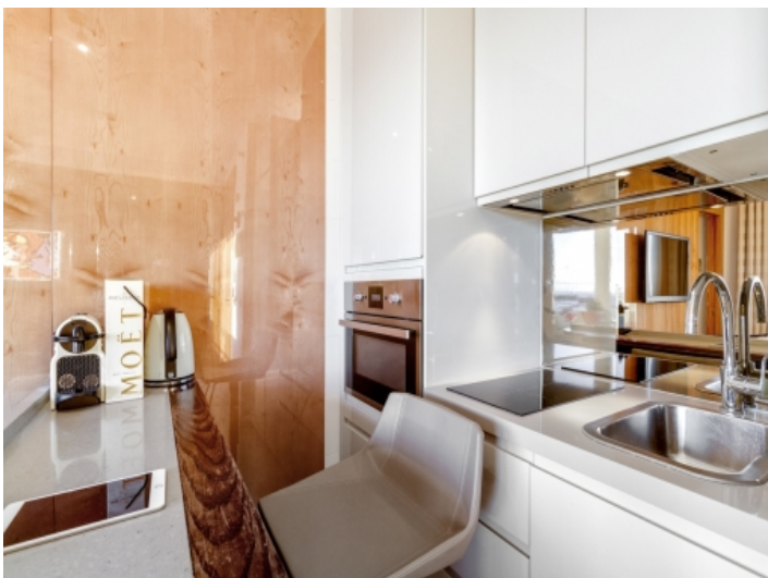
Lovely kitchen corner