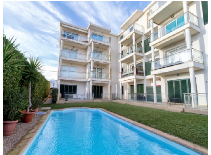
Exterior view of the apartment building