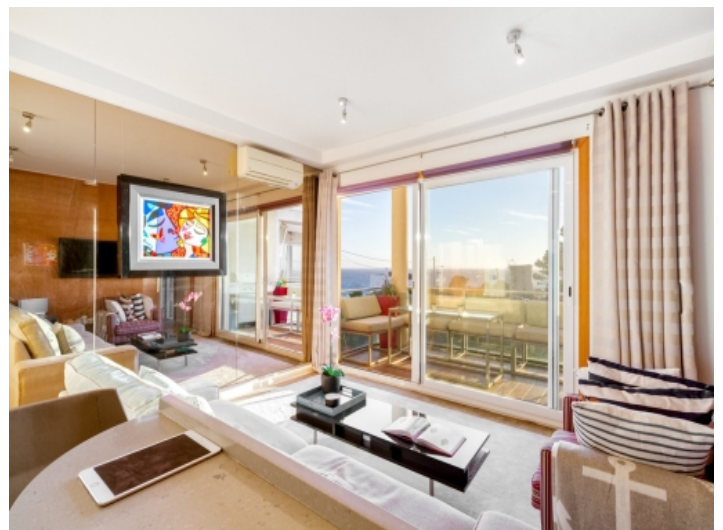
Panoramic windows and access to the balcony