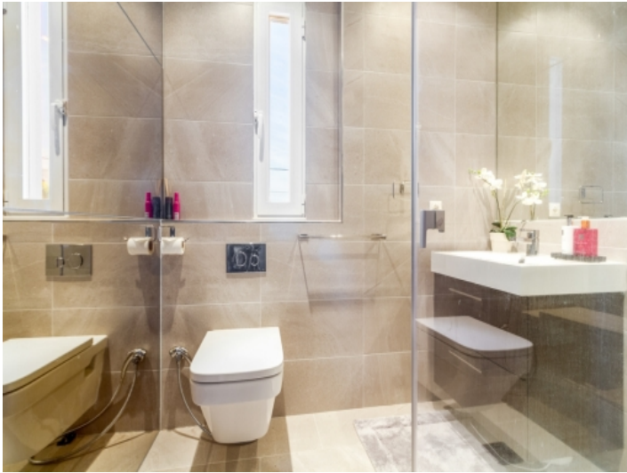
Beautiful bathroom with shower