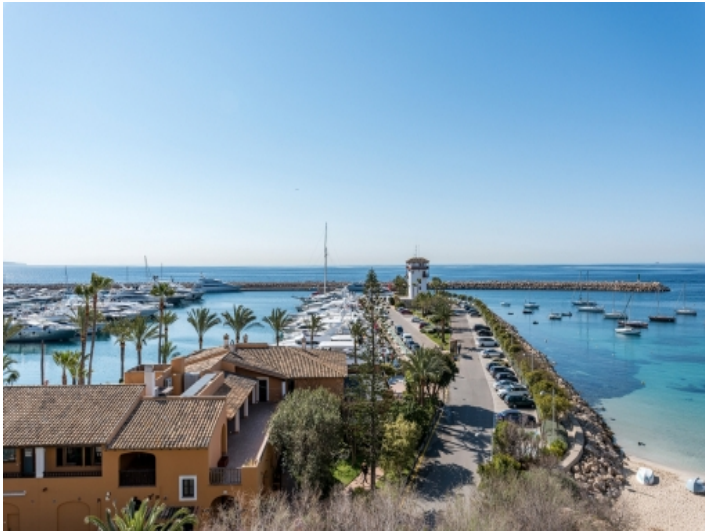
Stunning sea views of the apartment