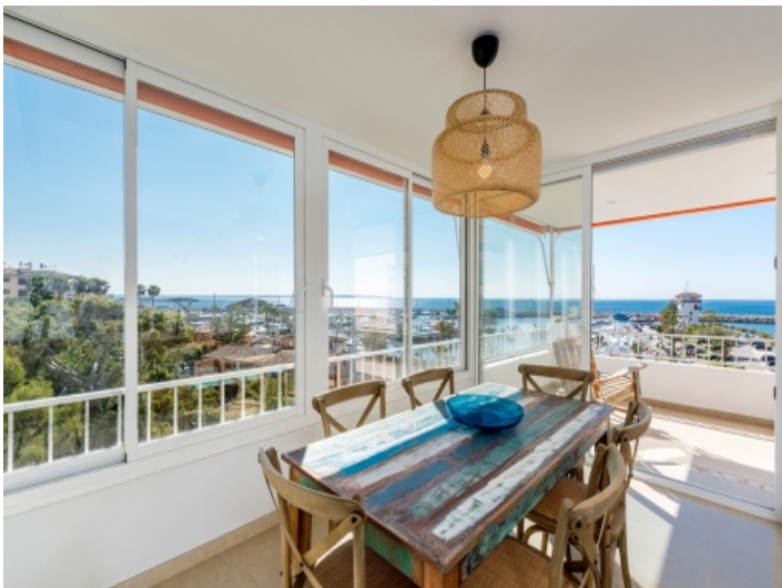
Inviting dining area