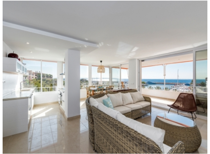
Spacious living and dining area