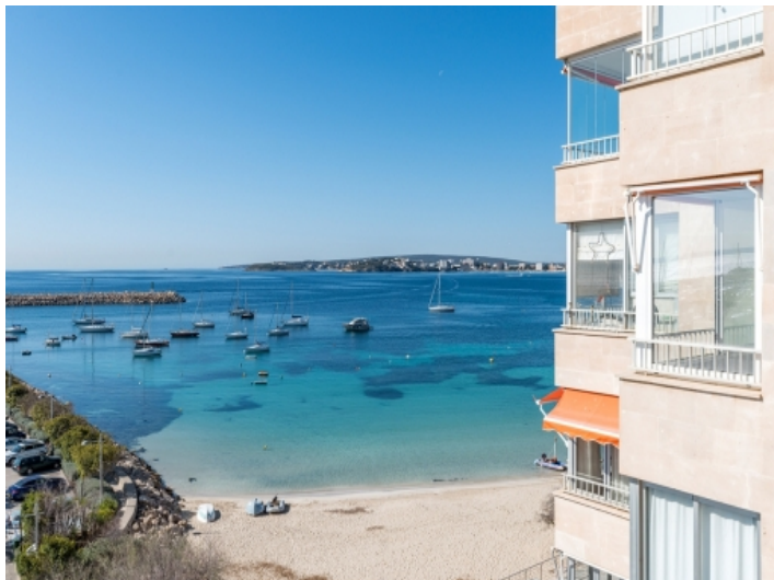
Beach right in front of the complex