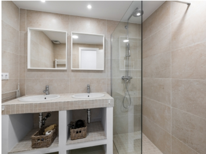
Elegant bathroom with walk-in shower