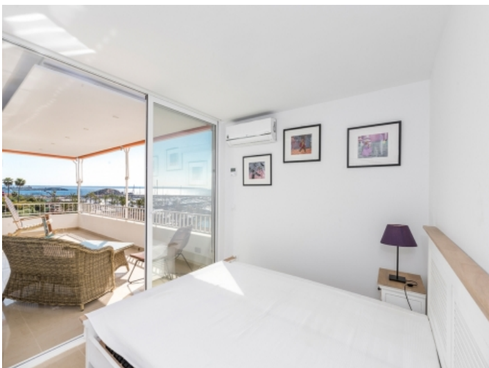
Master bedroom with balcony access