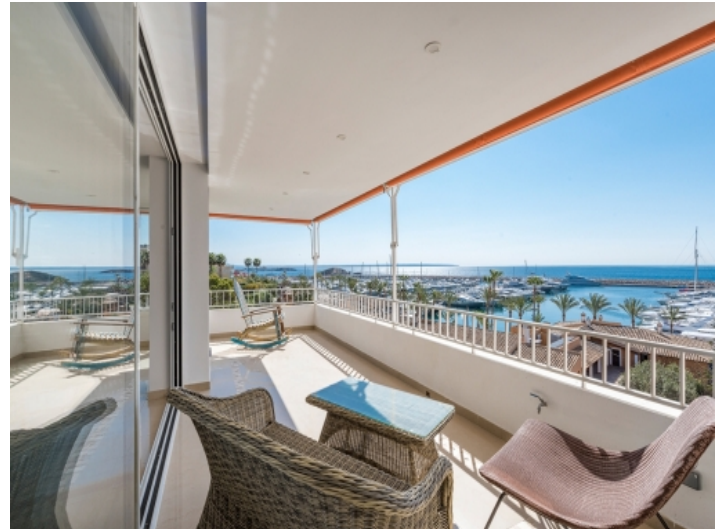
Chill out area on the balcony