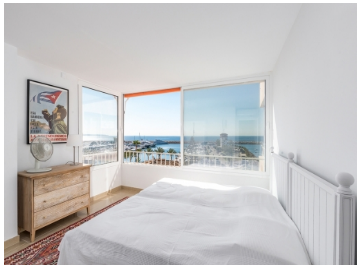
Second bedroom with a view