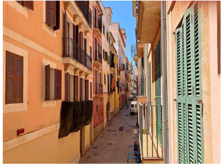
Charming street view