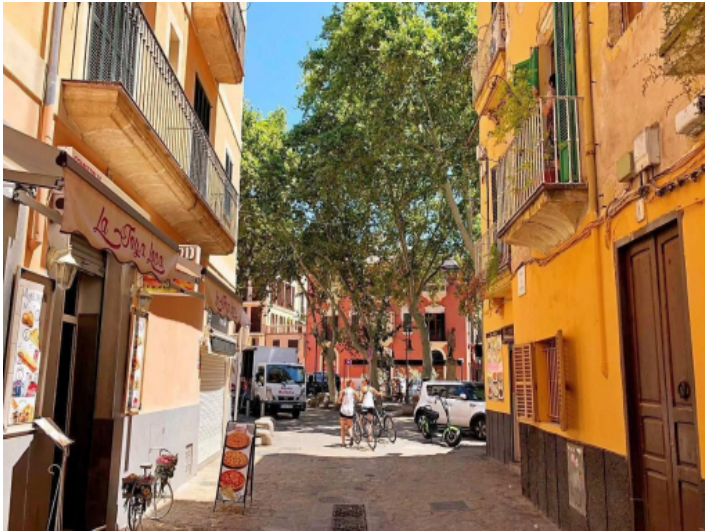
Beautiful apartment in Palma Oldtown