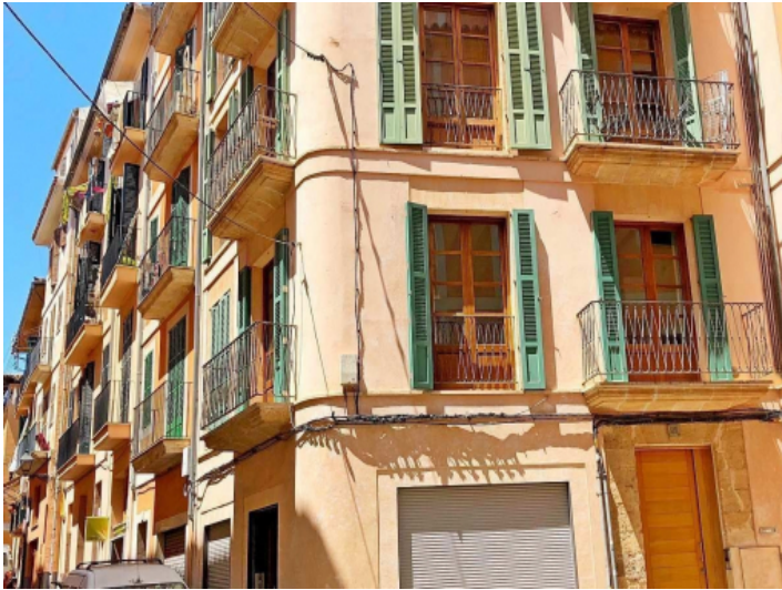
Exterior view of the building