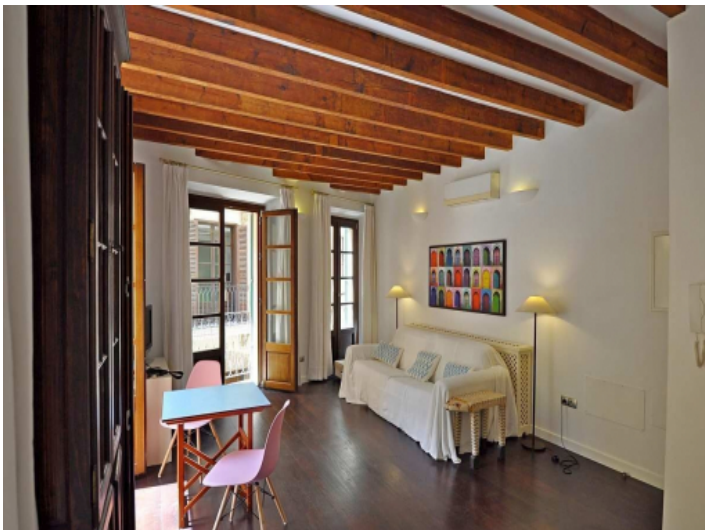
Living area with french balconies