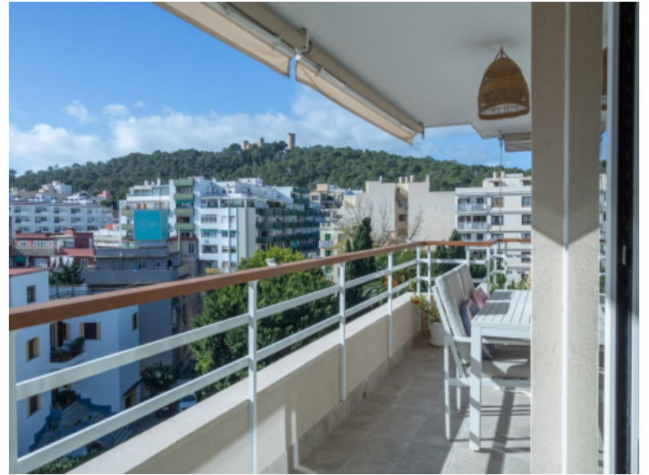
Spacious terrace with view of Bellver castle