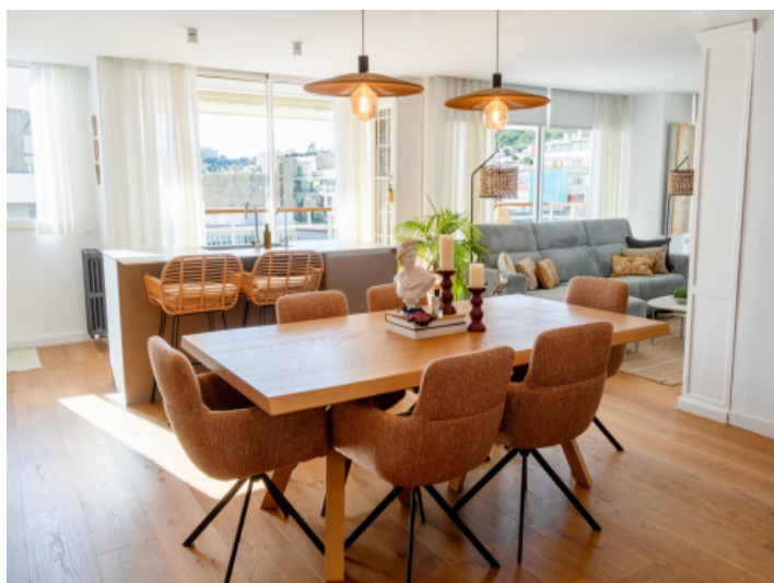
Dining area with open kitchen