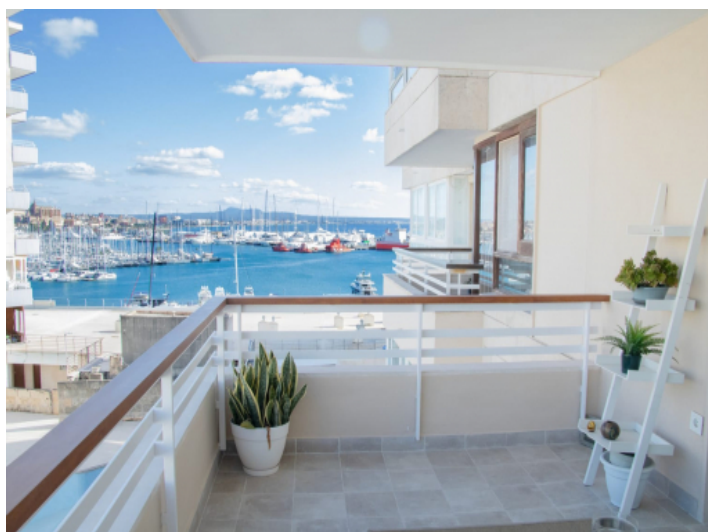
Sea view terrace