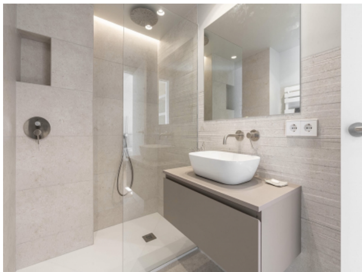
En-suite master bathroom