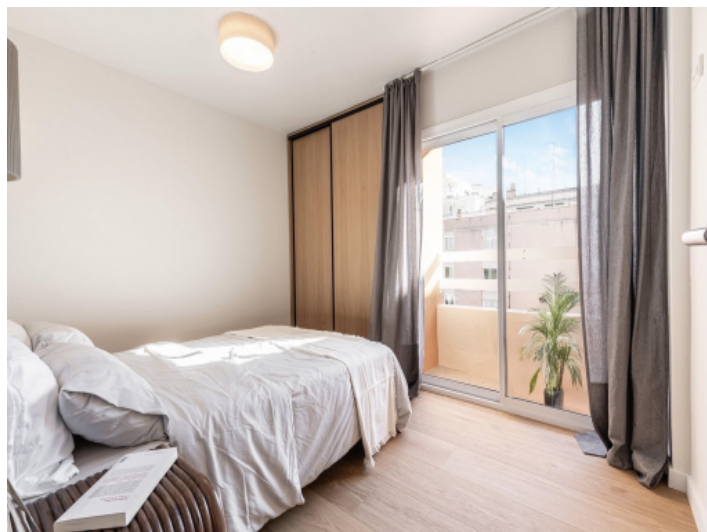
Additional bedroom with private terrace