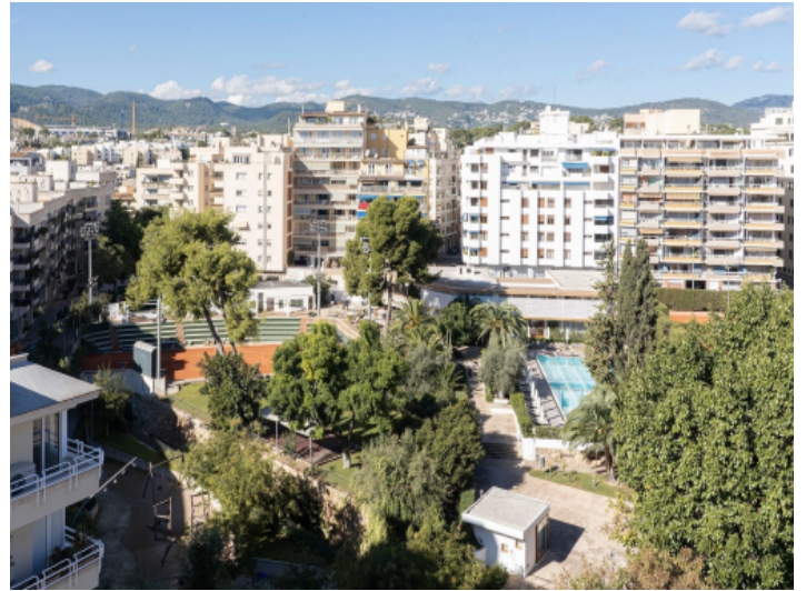
View over the Palma Tennis Club