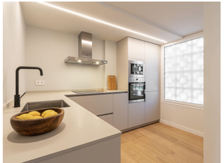
Modern fully equipped fitted kitchen