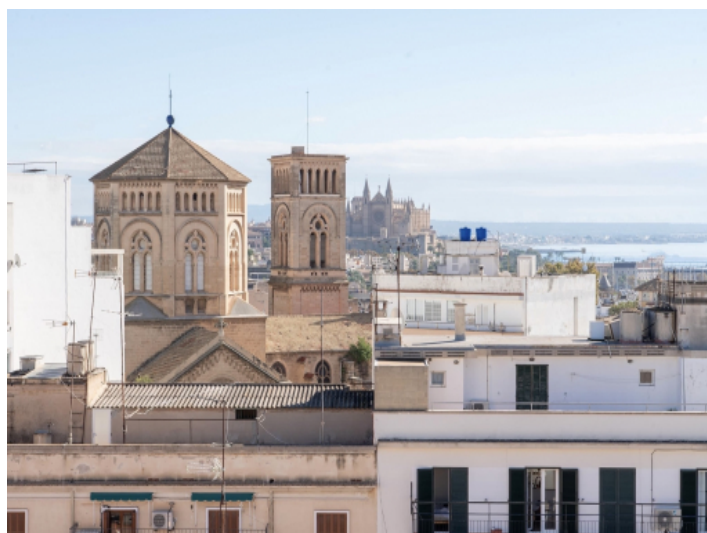
View reaching as far as the cathedral