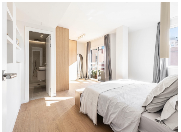
Master bedroom with private terrace