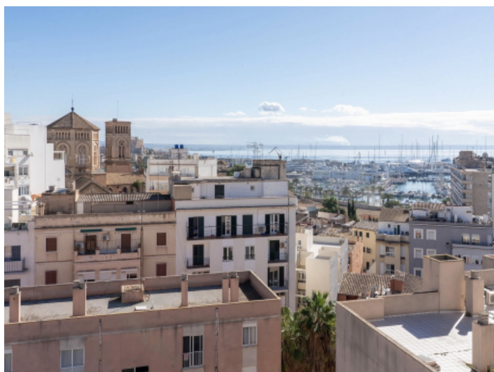
View from the communal terrace of the harbor and the sea