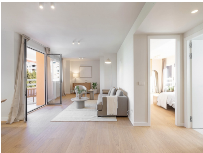
Spacious and open living area