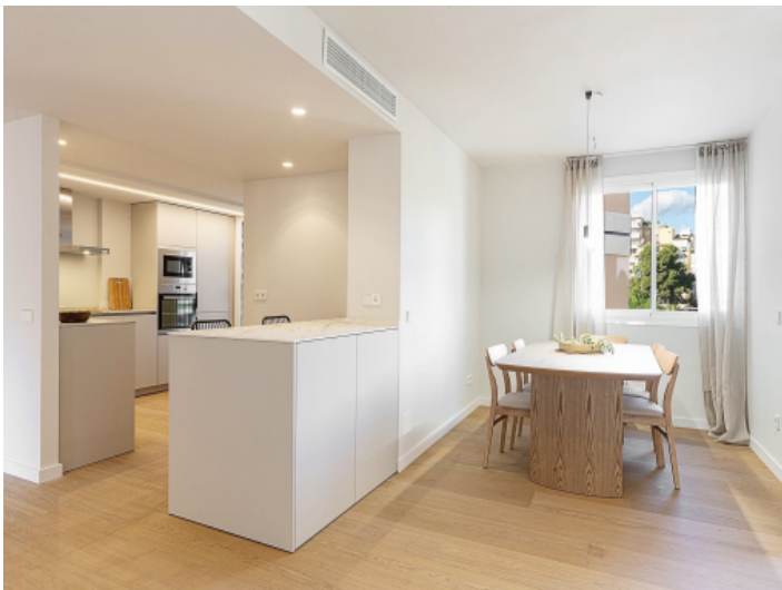
Bright dining area with adjoining open kitchen