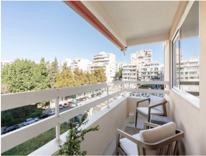
Covered main terrace overlooking the Palma Tennis Club