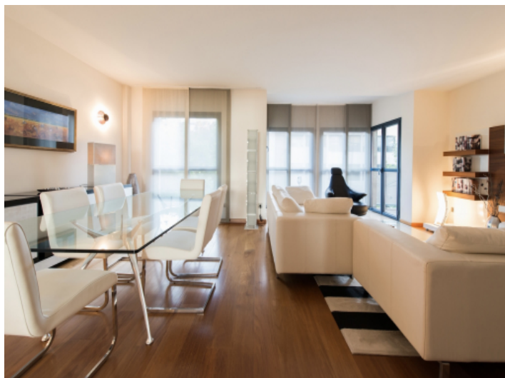
Spacious living and dining area