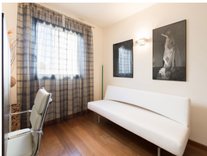
Third bedroom and office