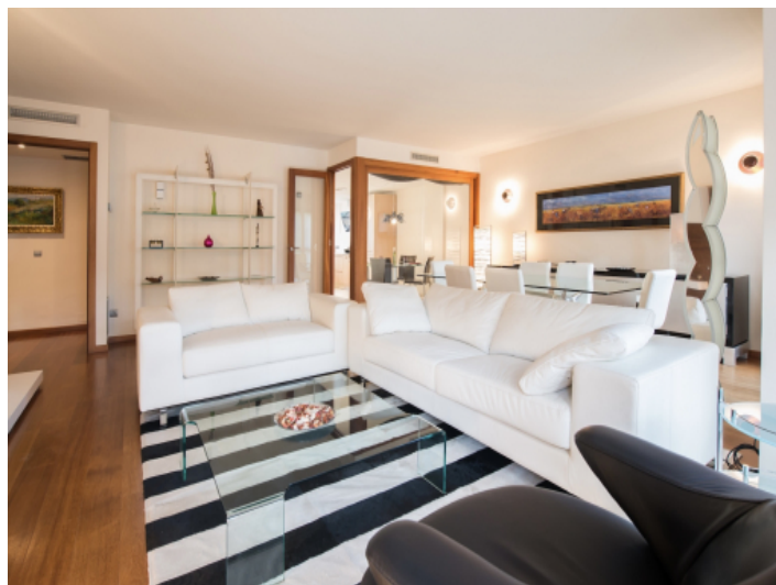
Cozy living room