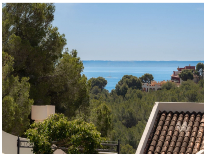
Partial sea view