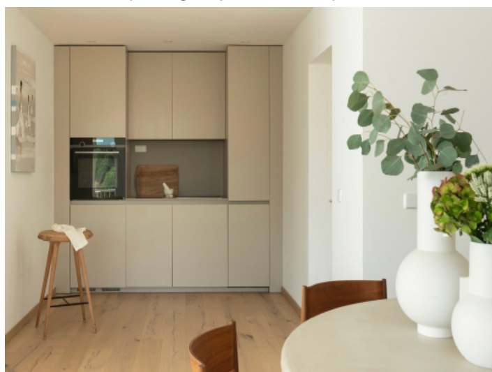
Tastefully furnished kitchen