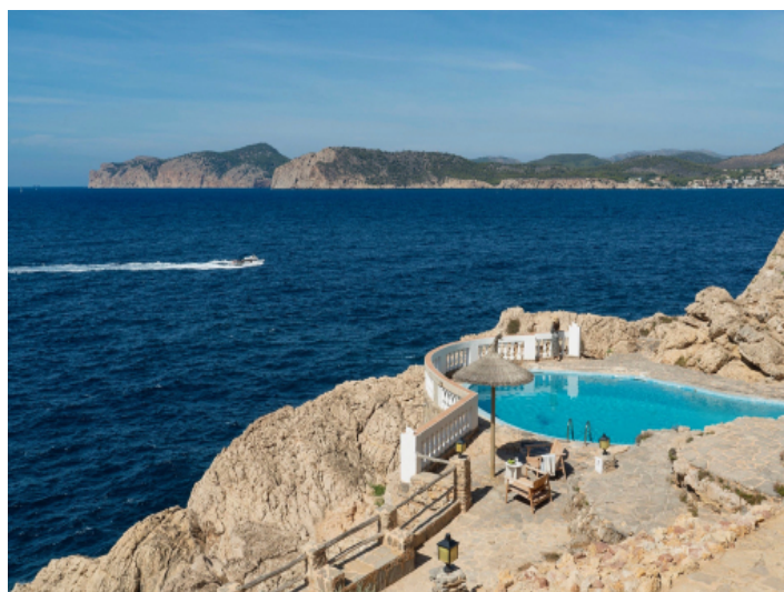
Well-maintained communal complex