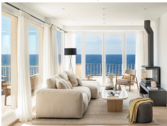
Living area with an impressive view of the Mediterranean Sea