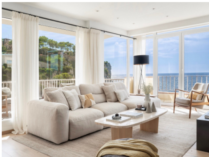
Light-filled living area with sea views