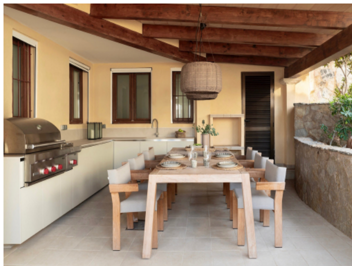
Covered terrace with fully equipped outdoor kitchen