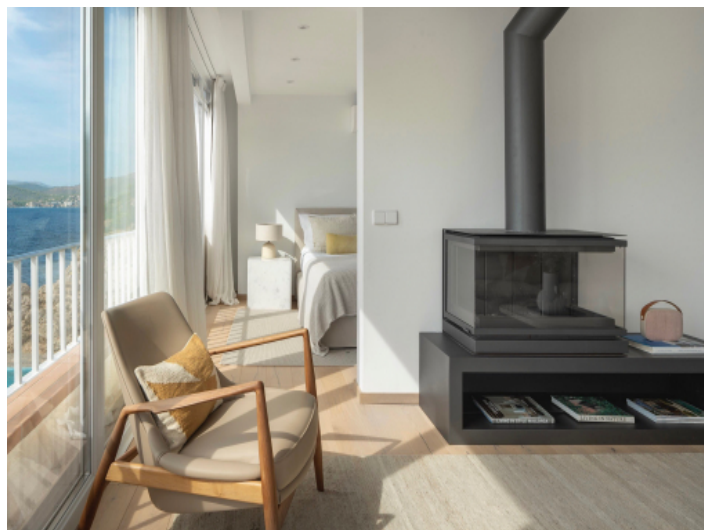
Open-plan living area with a cozy fireplace