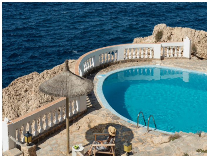
Communal pool right by the sea with panoramic views