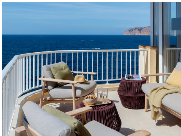
Terrace with stunning sea views