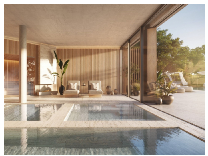
Large indoor pool