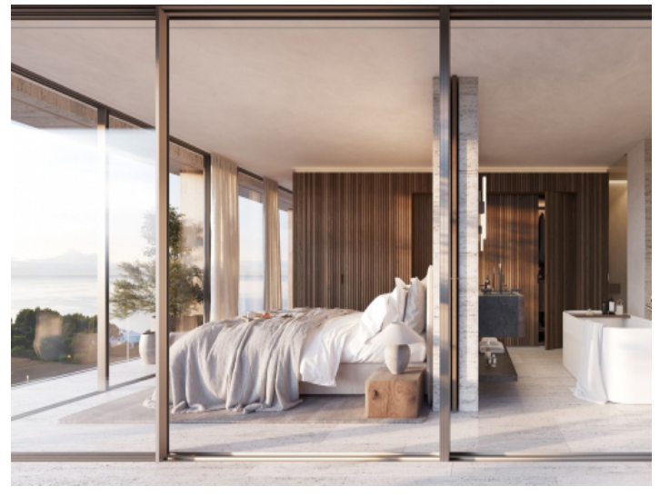
Light-flooded bedroom with sea views