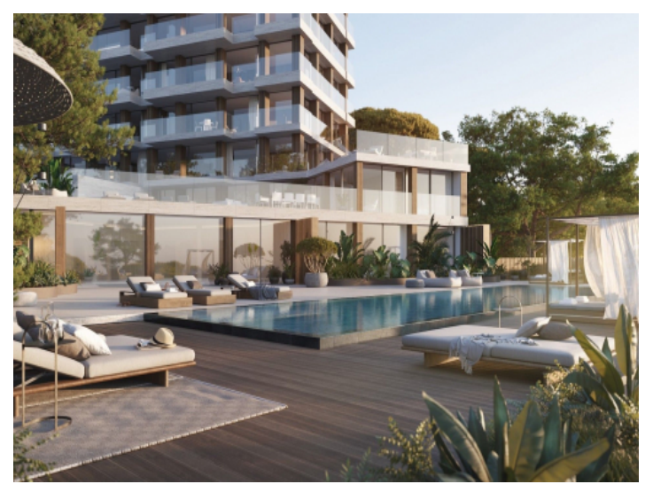
Fantastic communal pool area