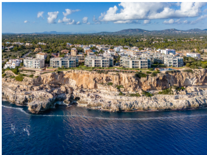
Mediterran sea views