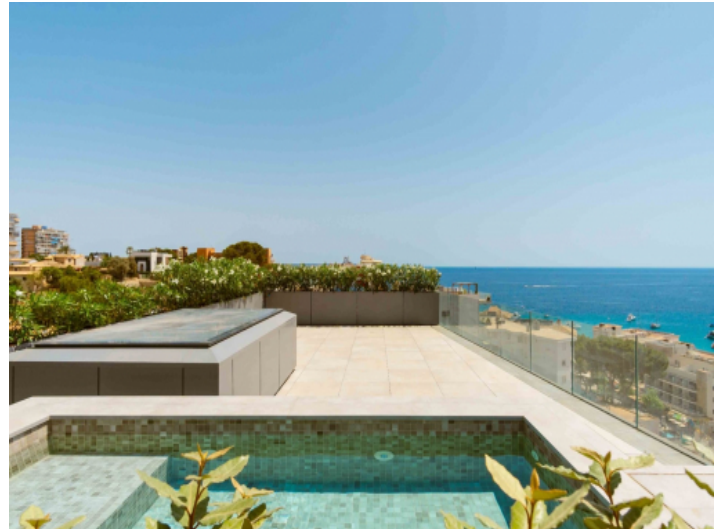
Rooftop terrace with pool