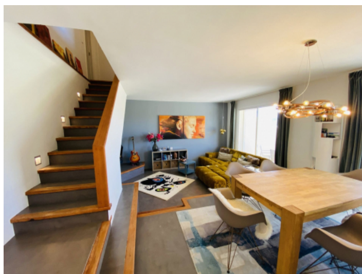
Living and dining area