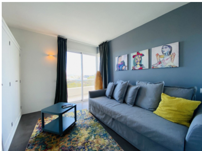
One of 3 bedrooms