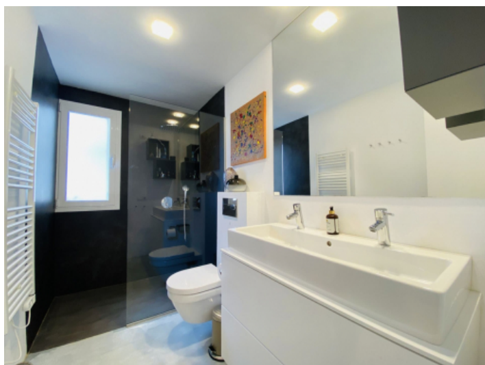
Bathroom ens uite