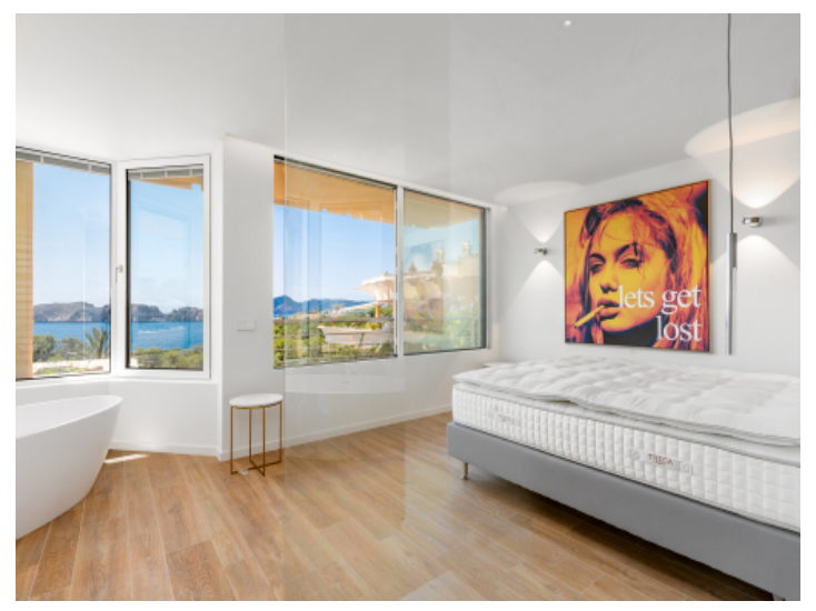
Bedroom with bathroom en suite