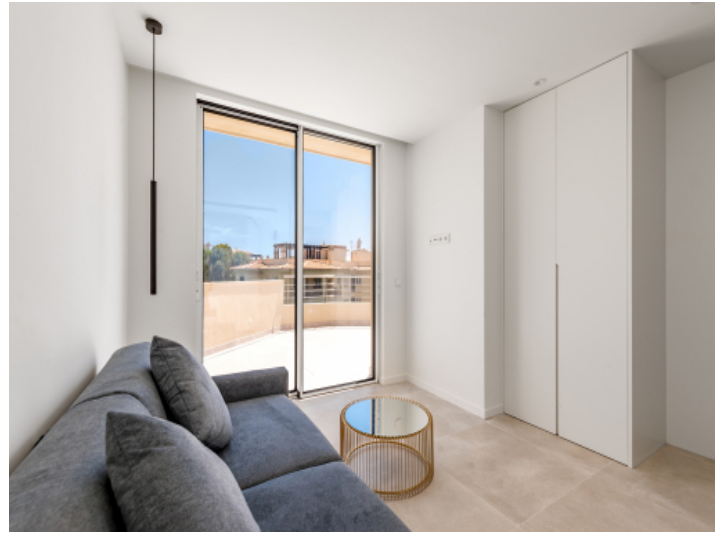
Another bedroom with built-in wardrobe