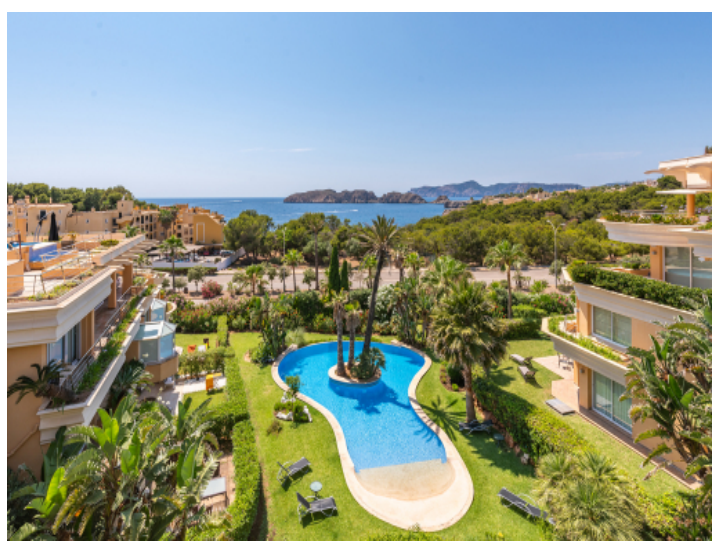
View of the community pool area