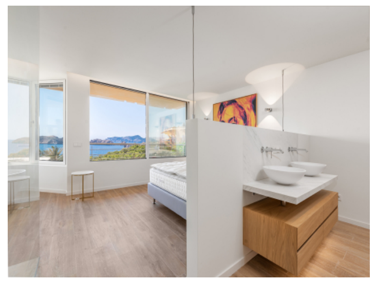
Bedroom with bathroom en suite