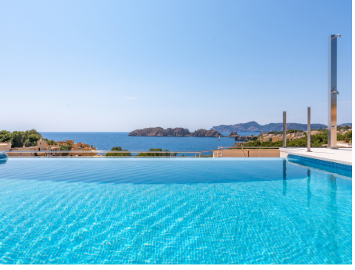
Infinity pool with sea views