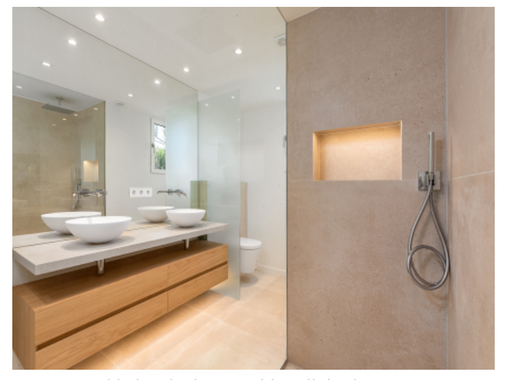
Modern bathroom with walk-in shower