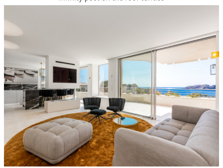
Open living area and kitchen with fireplace