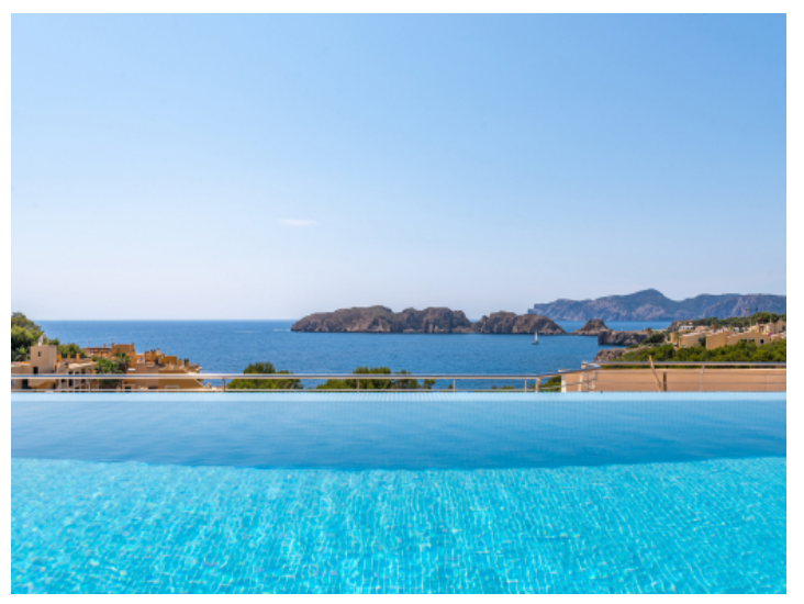
Infinity pool on the roof terrace