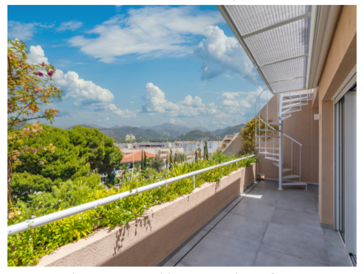
Lower terrace with access to the rooftop