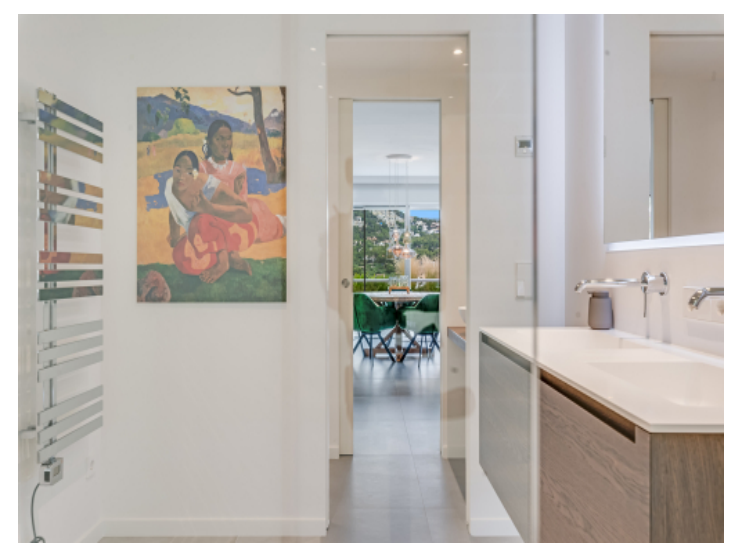
Bathroom with towel heater