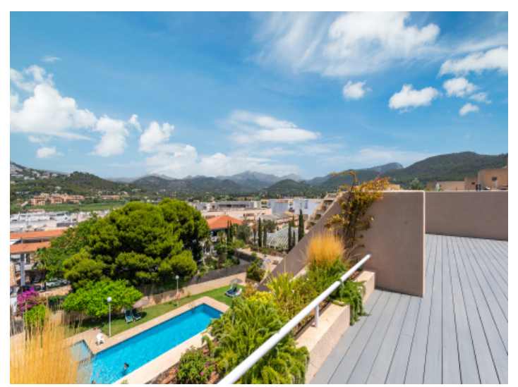
View to the communal pool