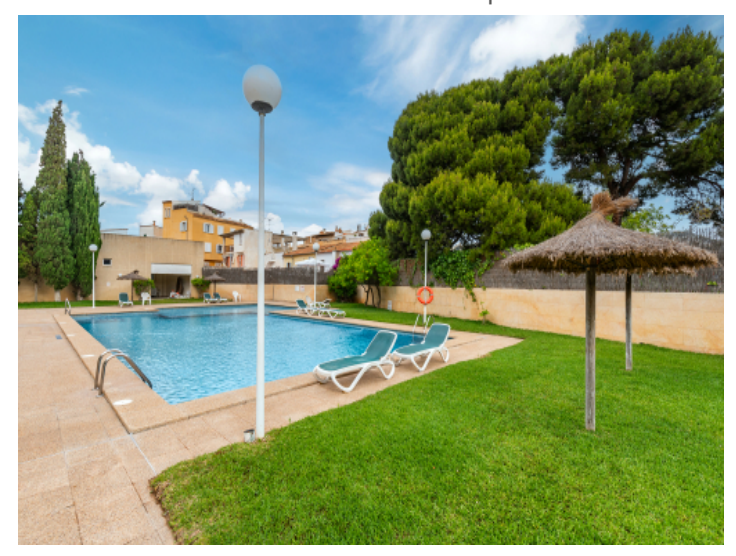
Communal pool area