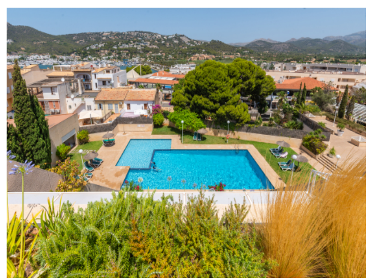
Views from the terrace to the community pool area