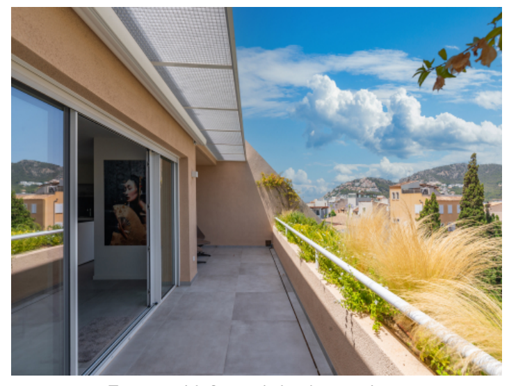
Terrace with fantastic landscape views