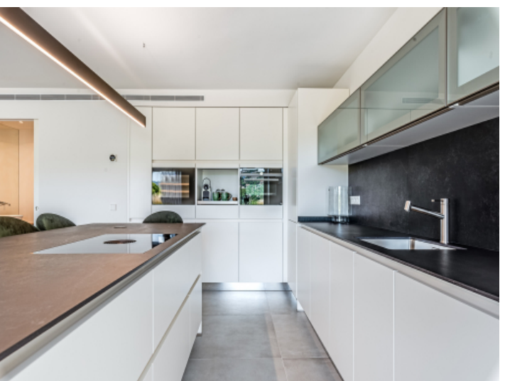
High quality kitchen