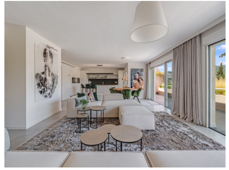
Elegant living concept