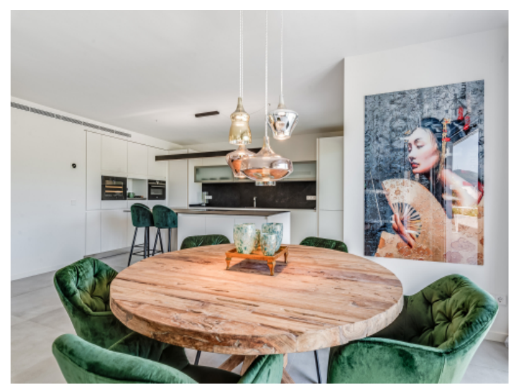
Modern dining area