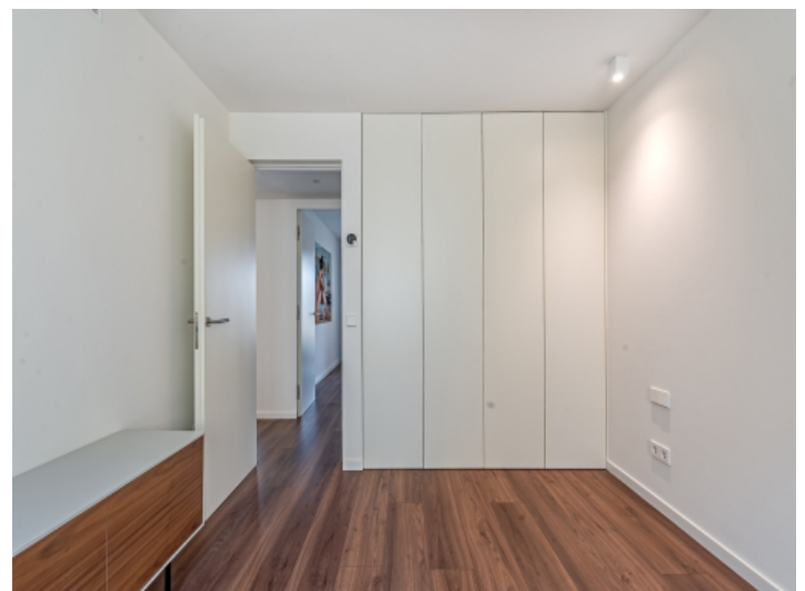
An other room with built-in wardrobe