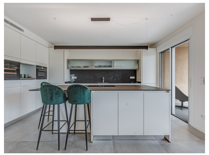
Open kitchen with bar