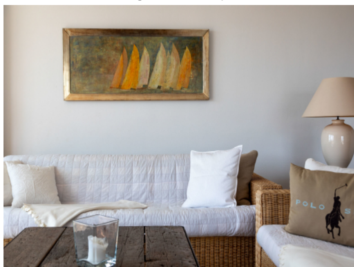
Comfortable living area