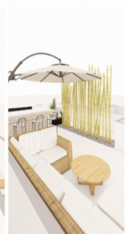
Plan roof terrace