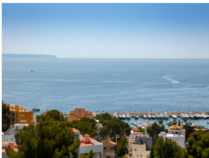
Fantastic panorama sea views