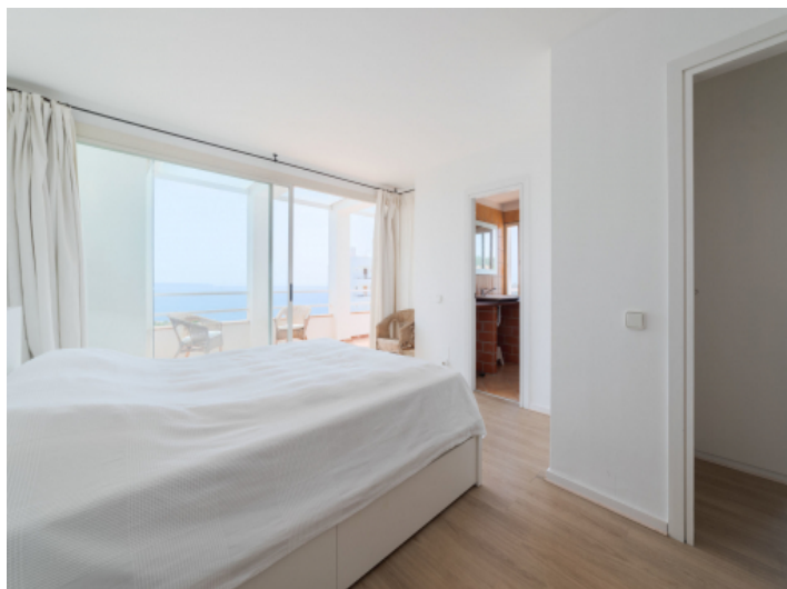
Bedroom with sea view terrace