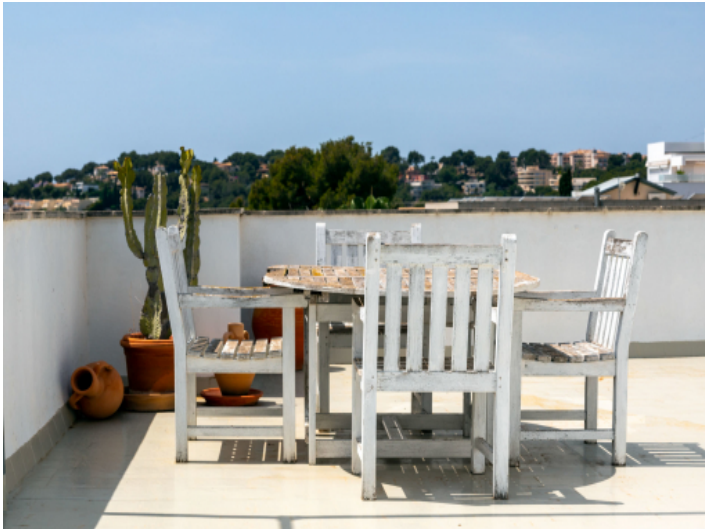
Further terrace with outdoor dining area