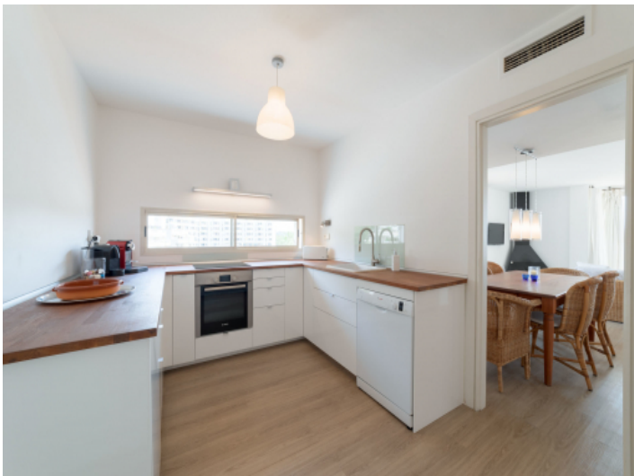
Half-open spacious kitchen