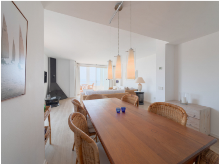
Adjoining dining area