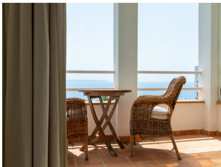
Wintergarden-like sea view terrace