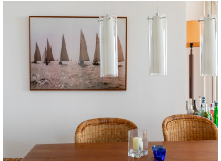
Beautiful dining area