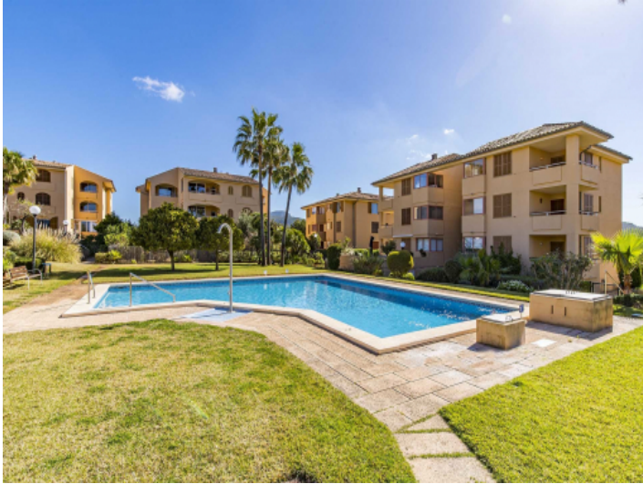
Beautiful residential complex