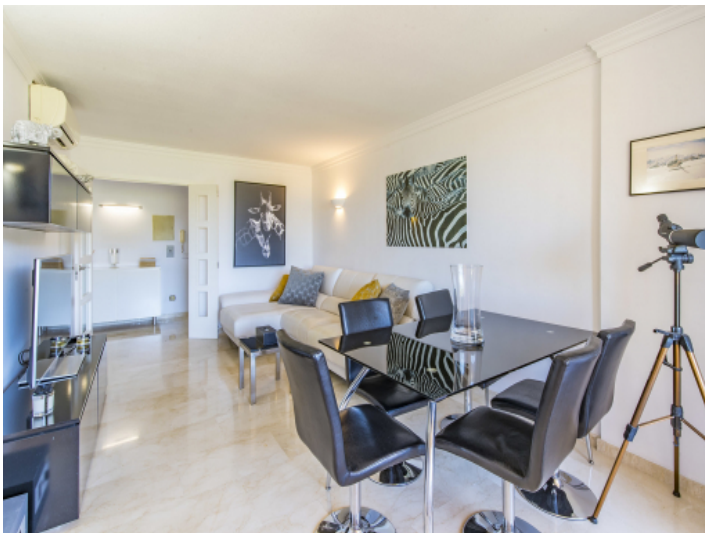
Modern living and dining area