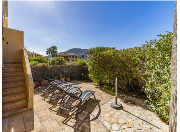
Beautiful sun terrace