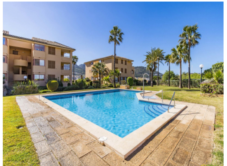
Large communal pool area