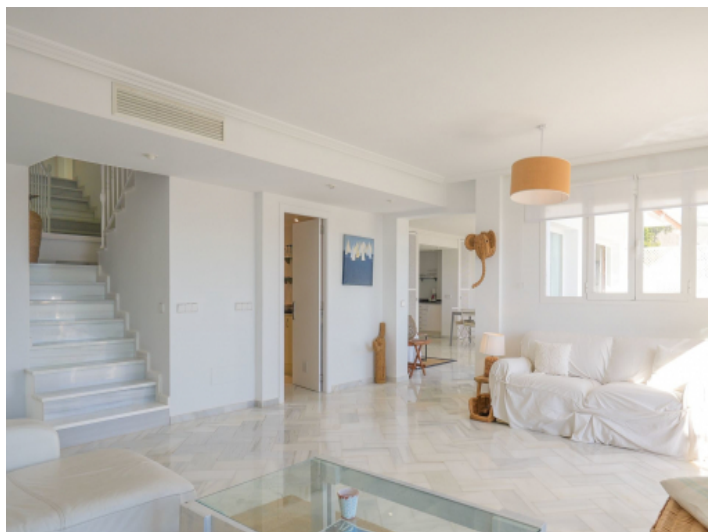
Living area with staircase to the upper floor