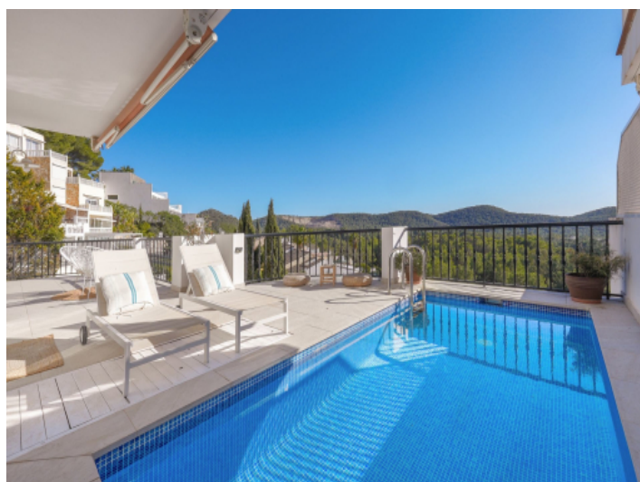
Beautiful private pool