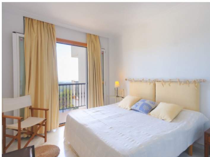
Bedroom with french balcony