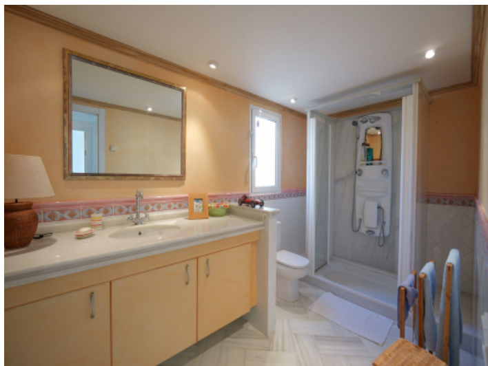
One of 6 bathrooms