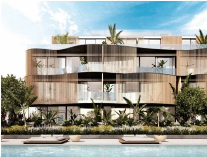
Exterior view of the complex