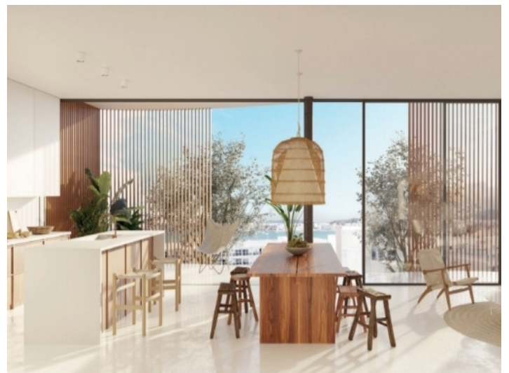
Living area with large panoramic windows