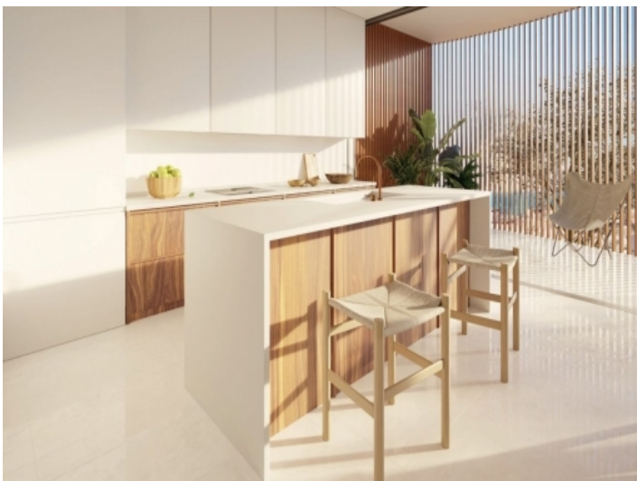
Modern kitchen with cooking island