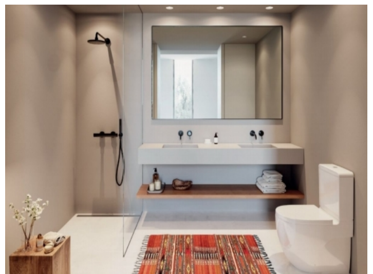
Elegant bathroom with walk-in shower