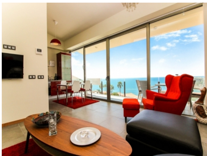
Amazing sea views from the living area