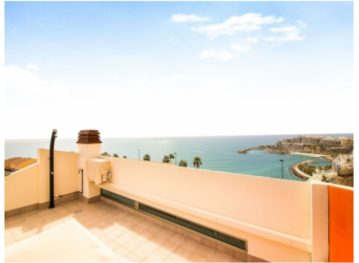
Roof terrace with sea views