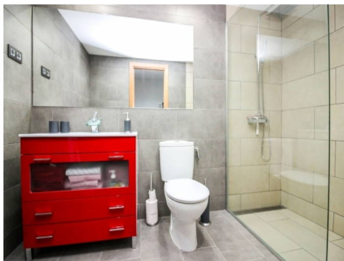
Modern bathroom with shower