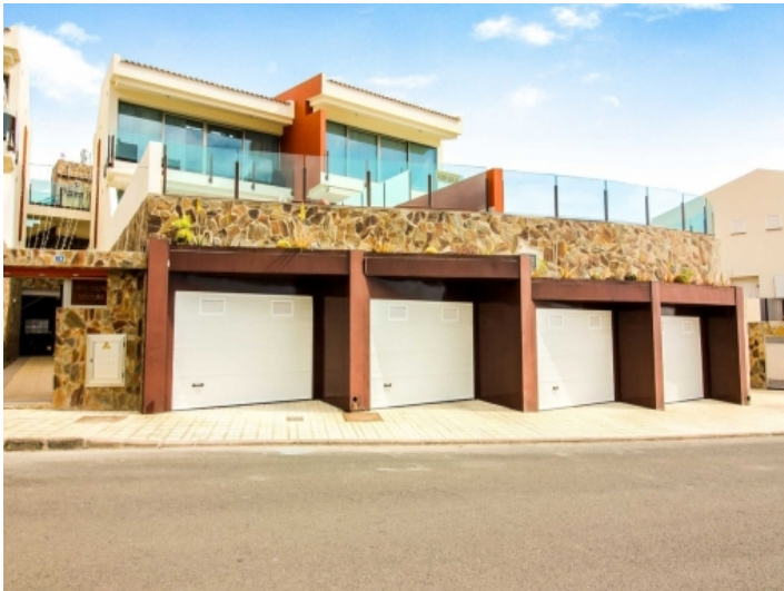
Exterior view with garage