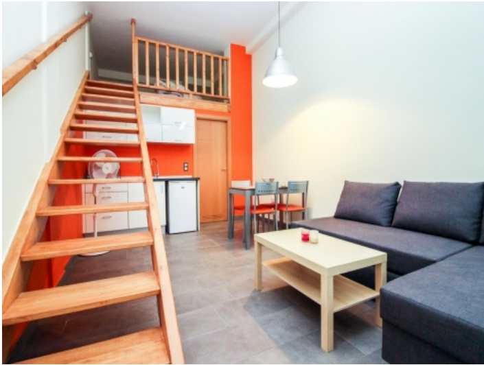
Further living area