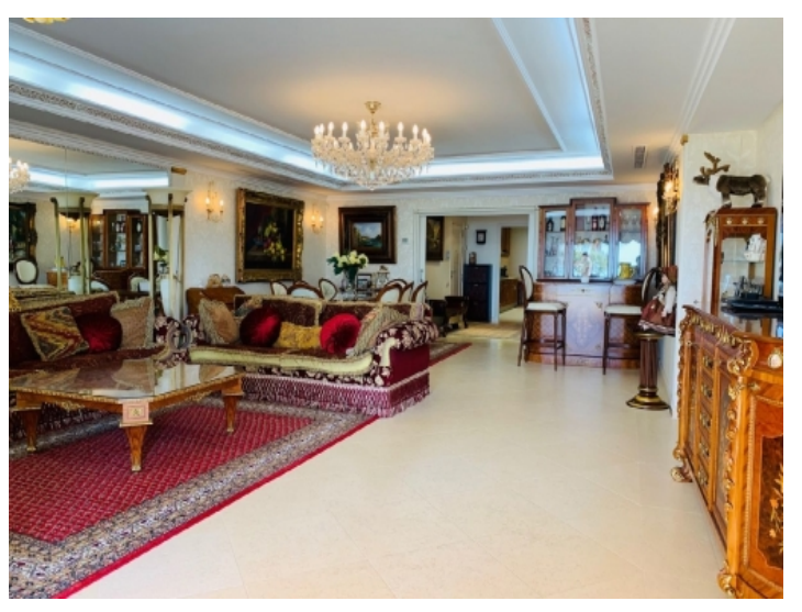
Spacious living area