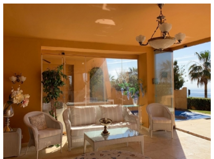
Cosy seating area