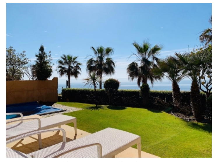
Sunny garden and pool area