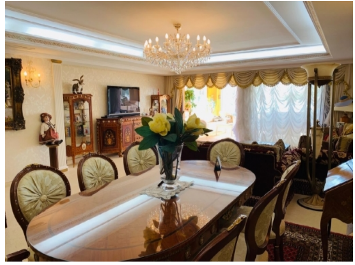
Dining area with wooden furniture