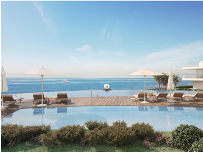
Pool area in first sea line