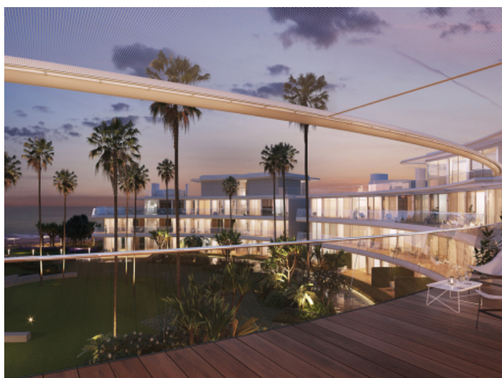
Views from the terrace