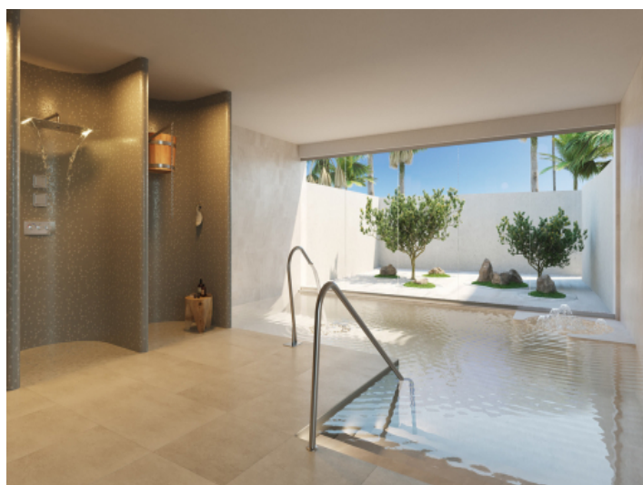
Luxurious indoor pool