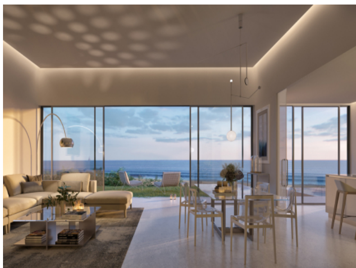
Amazing sea views from the living area