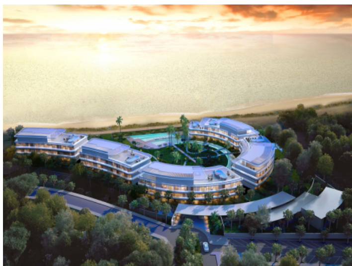
Bird's eye view of the complex