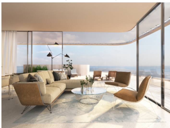
Spacious living area