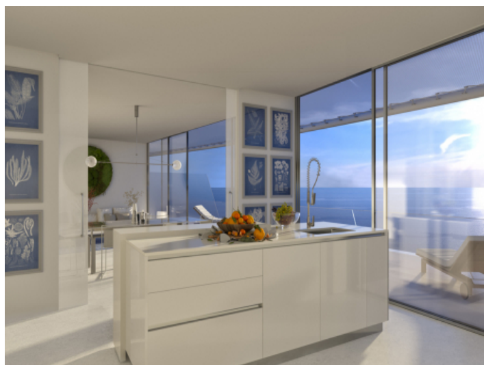
Open plan fully equipped kitchen