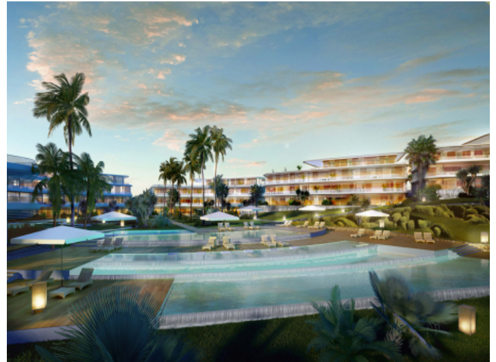
Beautifully designed pool area