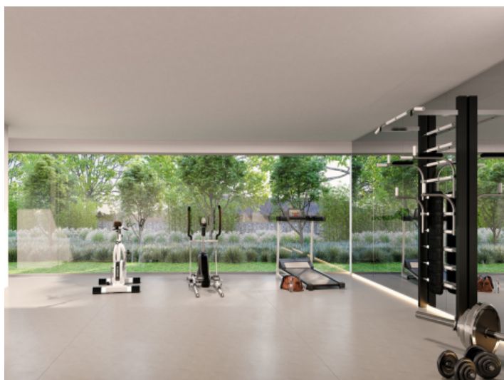
Home gym in an idyllic environment