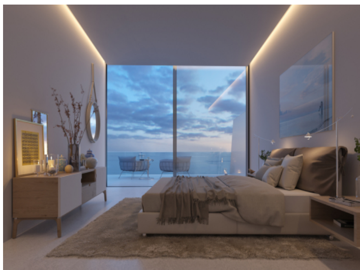
One out of 3 bedrooms