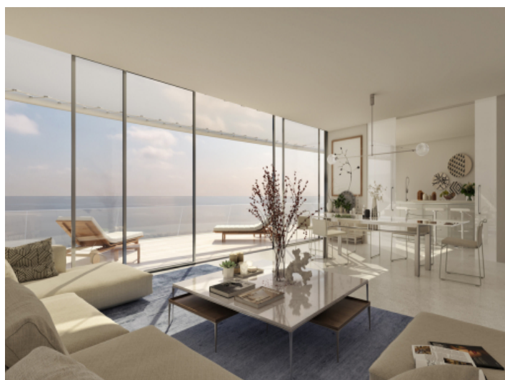
Lightflooded living and dining area