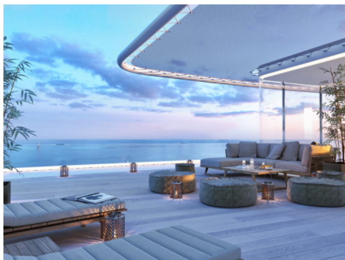
Covered first sea line terrace