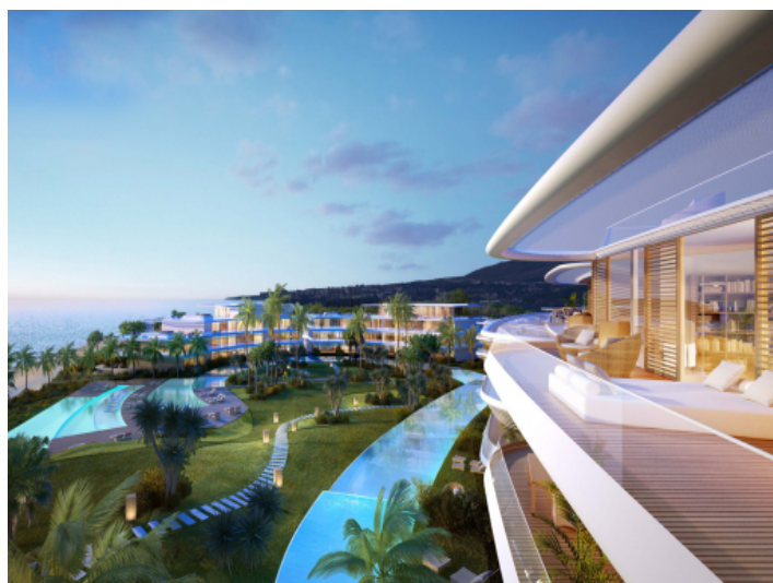
Terrace with dreamlike sea views