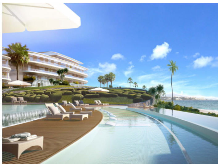
Stunning pool area