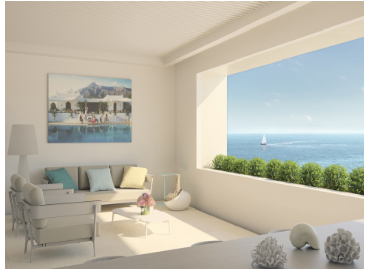
Beautiful views from the terrace