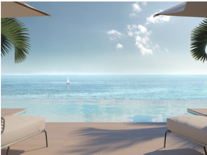
Dreamlike views from the pool