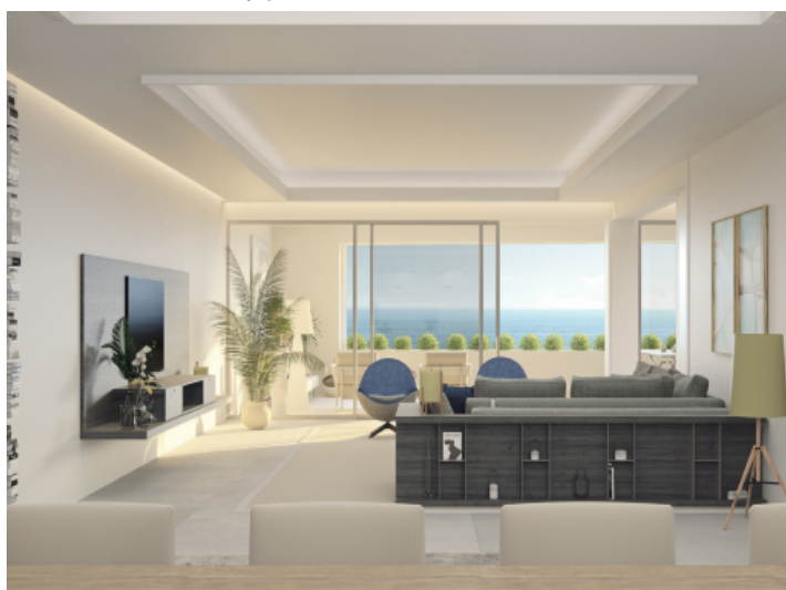
Brand new, spacious penthouse at the beach