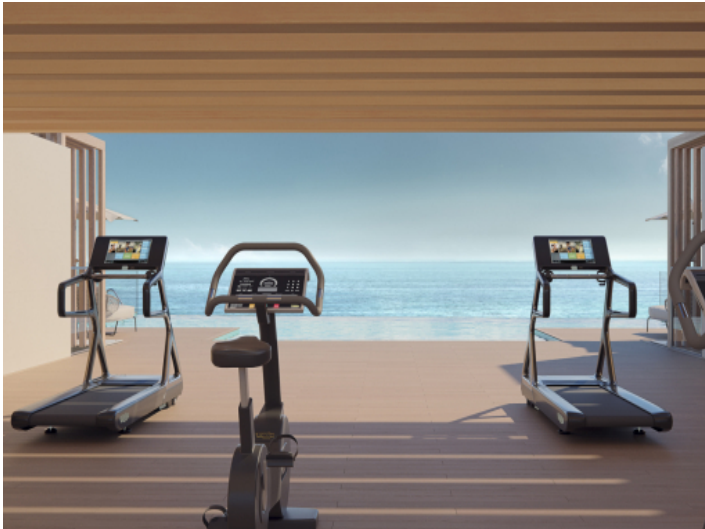
Gym in front of the infinity pool