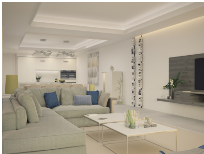
Spacious living and dining area