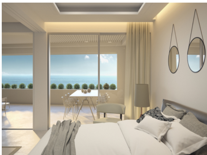
Bedroom with stunning views