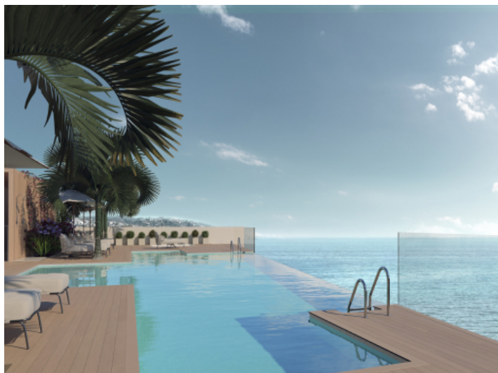
Infinity pool with unbelievable views