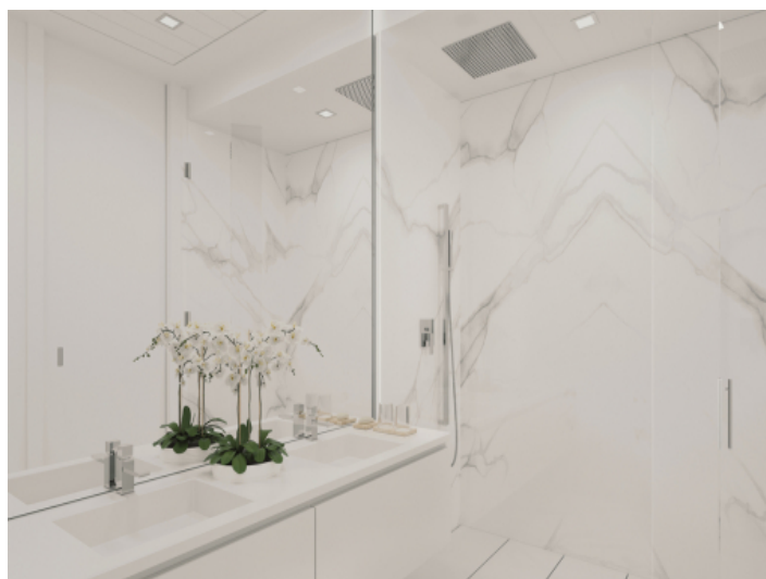
One out of 2 bathrooms