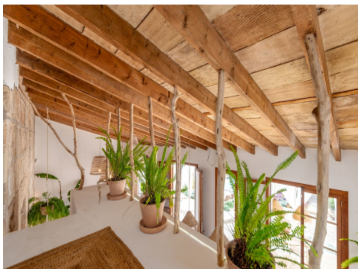
Chill out area