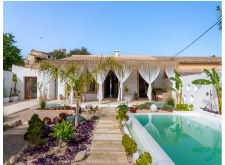
Beautiful villa with pool in Establiments